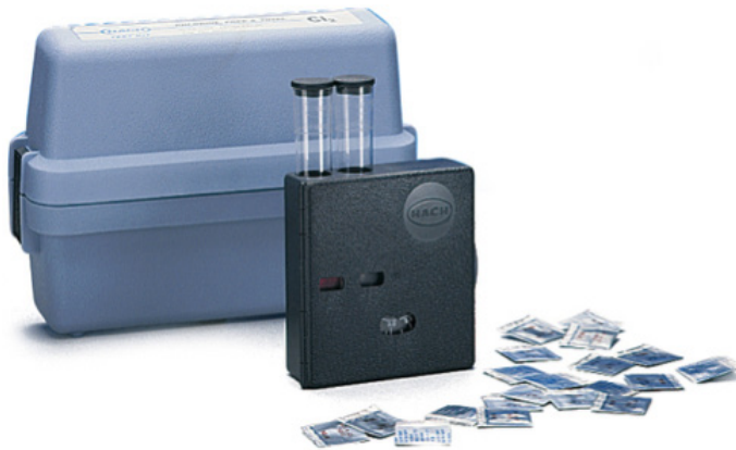
Figure 6. Free chlorine test kit. Hach® (no endorsement implied)