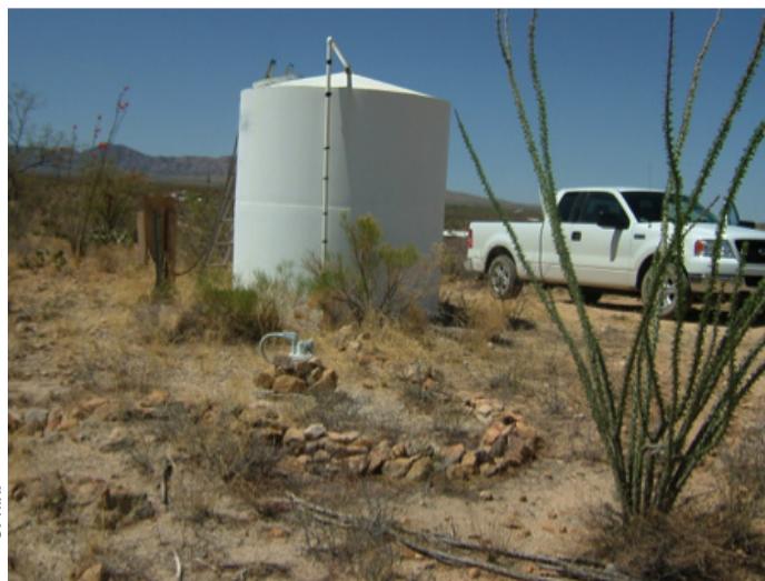
Figure 1. Above-ground steel water storage tank painted white to reflect light.

Sizes: Custom metal shops can manufacture tanks locally and build them in custom made shapes and sizes. Only companies