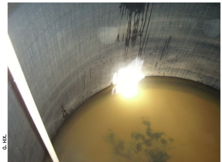
Figure 4. Inside a water storage tank nearly empty, sediment and algae growth visible.

ways including: from naturally-occurring organic matter in the aquifer water, from aquifer contamination (such as septic system seepage), from the growth of microorganisms inside the tank itself, and from air dust. Slime, often accompanying mineral residues, is produced by an overgrowth of bacteria and algae.