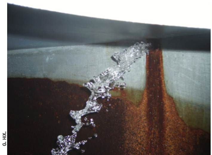
Figure 3. Inside of a water storage tank with visible rust.

Organic matter, found in the tissue of living and dead organisms, can be introduced to water storage tanks several