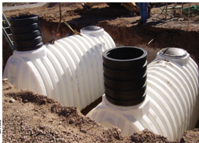
Figure 2. Underground, polyethylene water storage tanks.

that have access to the proper polymer materials and special molds can manufacture extruded round polyethylene tanks in large quantities. Molded polyethylene tanks are relatively light in weight, but they are very bulky and difficult to package in quantity and transport very far. Tanks that can hold larger volumes of water are usually brought on site and permanently mounted in place. Tanks that are manufactured primarily for transporting potable water are often made of a translucent polyethylene with a white tint. The water level is clearly visible through the walls of the tank, which