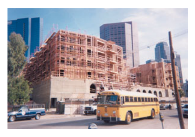
Figure 4. Apartment complex utilizing FRTW studs

The apartment complex in Figure 4 contains 500,000 square feet of residential space, 40,000 square feet of retail space, and a 350,000 square foot parking garage. The wood frame portion of the building is Type III-211-S construction. The exterior bearing walls are constructed with fire-retardant-treated wood studs. The interior framing is untreated wood.