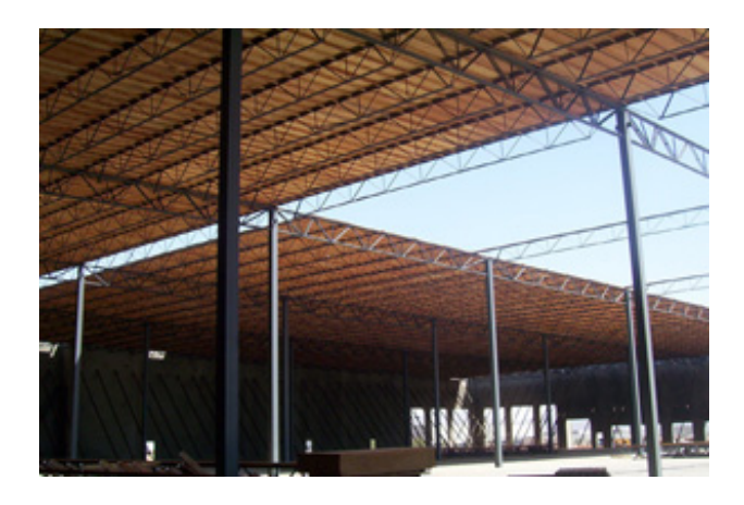
Figure 3. FRTW panelized roof system

The ability to pre-frame large roof panelized units reduce cost, cuts construction time, and enhances job site safety since fewer man-hours are spent on the roof. Panelized roof systems are one of the safest systems to erect because most of the work is accomplished on the ground during the fabrication of the large pre-framed roof panels.