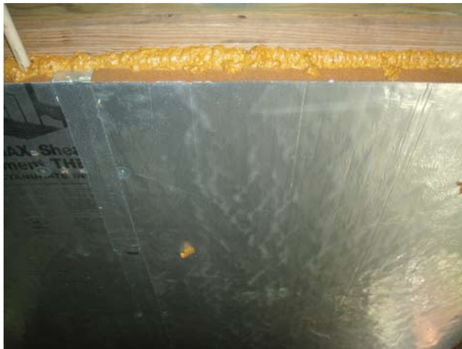
Figure 4a. Example of rigid, foil-faced polyisocyanurate foam.

Air temperature and humidity were measured with data loggers placed indoors, outdoors and in crawl spaces. Moisture content and temperature of the wood or plywood subfloor was measured, typically twice each month. Monitoring started in October 2008 and concluded in October 2009.