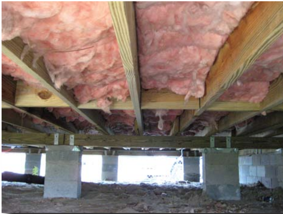
Figure 4d. Example of typical fiberglass batt insulation.