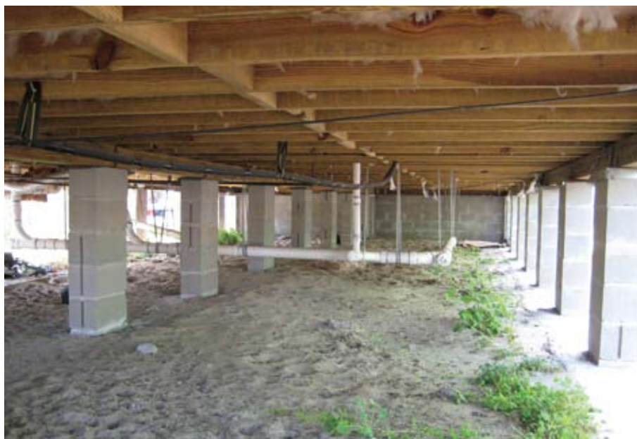
Figure 1. Example of an open crawlspace.

The rates of wetting and drying of building assemblies, whether they are floors, walls or ceilings, can be affected by thermal insulation. The job of thermal insulation is to slow down heat flow – to help keep the inside of the house warm when it's cold outside and cool when it's hot outside. In addition to its thermal resistance, insulation provides some resistance to moisture migration, and this resistance can vary widely between different types of insulation. Insulation's effect on limiting heat flow will coincidentally make certain parts of the floor assembly warmer (or cooler) than other parts of the assembly. This is important because wood tends to dry when it is warm relative to its surroundings and is prone to moisture accumulation when it is cooler than its surroundings.