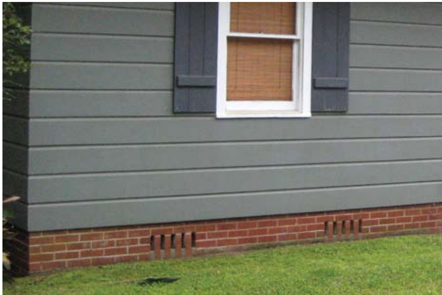
Figure 2. Example of a wall-vented crawl space.