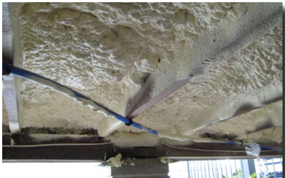
Figure 4c. Example of open cell spray foam.

All insulation systems were nominally R-13, except the batt insulation, which was nominally R-19.