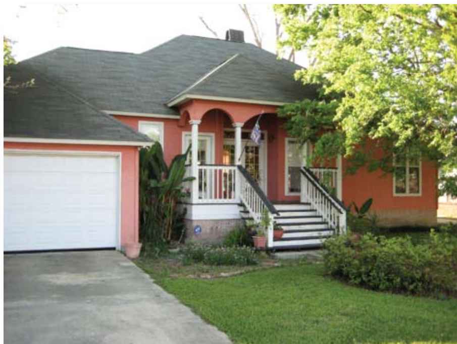
Raised floor home in Baton Rouge

In contrast, if the floor finish was vinyl, the vapor retardant paint applied over open cell foam appeared to result in lower subfloor moisture contents on average (relative to an otherwise identical floor system with the vapor retardant paint omitted), but some individual moisture readings still exceeded 16 percent moisture content. The data regarding the effect of vapor retardant paint were not conclusive, and further research is needed to determine whether the combination of open cell foam and vapor retardant paint can be a reliable strategy for preventing summertime moisture accumulation in subfloors in this climate.