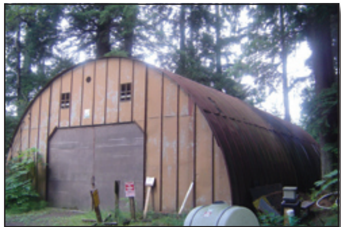
Figure 6—Masonite was often used to finish the interiors of the Quonset huts that the Forest Service acquired from the military after World War II. This Quonset hut is now used for storage at the Duck Creek Administrative Site (Juneau Ranger District, Tongass National Forest, Alaska Region).