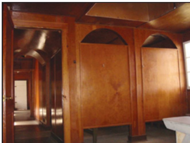
Figure 7—The interior of the infirmary at the Rabideau CCC camp (recently designated as a National Historic Landmark) is finished in varnished plywood, including curved vaults in the hallway and some rooms. Camp Rabideau is part of the Blackduck Ranger District (Chippewa National Forest, Eastern Region).

The first standard-size sheets of plywood were 3 by 6 feet, but by the early 1930s, 4- by 8-foot sheets were standard. They typically had an odd number of layers, although plywood with even numbers of layers has been produced since World War II. As the techniques for manufacturing plywood were perfected, manufacturers increasingly offered plywood with decorative veneers and finishes. Some were made with striations or V-shaped grooves carved into them. Others were embossed or prefinished in several colors.