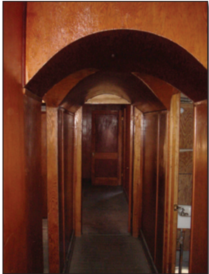
Figure 1—Varnished plywood covers the walls and ceiling of the Rabideau infirmary, which was built in 1935.

As noted in the tech tip, Early 20th-Century Building Materials: Introduction ( http://www.fs.fed.us/t-d/pubs/htmlpubs/htm06732314/ Username: t-d Password: t-d), the Forest Service always has encouraged the use of wood-based products in its facilities. As early as 1933, acceptable wall and ceiling products included fiberboard (sometimes