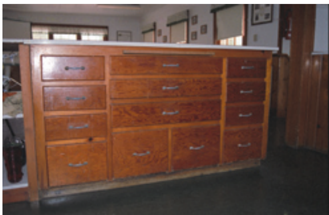
Figure 8—These plywood cabinets, constructed by the CCC in the cookhouse at the Fenn Ranger Station, are on the kitchen side of the serving counter. In this structure, cabinets visible only to the cook are plywood, while cabinets visible from the dining room are constructed of solid lumber.

Originally limited to door panels, walls, and ceilings (figure 7), plywood eventually was accepted in other applications, such as sheathing and cabinetry (figure 8), and exterior finished surfaces.