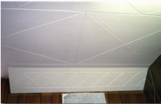
Figure 4—The fiberboard ceiling in the Fenn Ranger Station office (Moose Creek Ranger District, Nez Perce National Forest, Northern Region) has been carved and painted.

ploded them with such force that the wood fibers separated. Masonite Corp. later concentrated on producing its popular hardboard (see the Hardboard section).