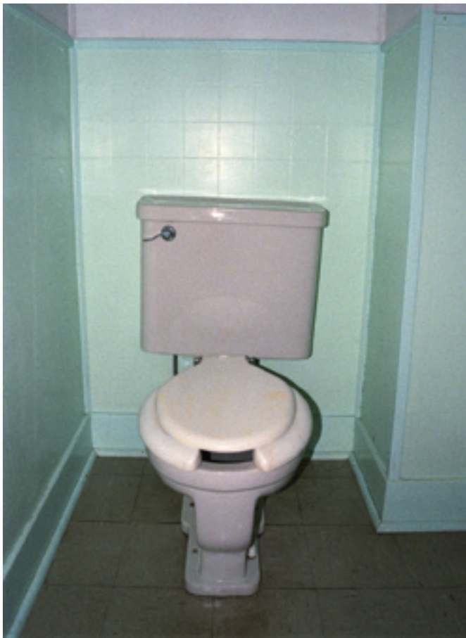
Figure 5—Temprrtile, a hardboard product embossed to resemble tile, was used as a water-resistant wainscot in the cook's bathroom at the Fenn Ranger Station.

Masonite and other hardboards became staples of premanufactured housing and lined the interiors of more than 150,000 Quonset huts during World War II (figure 6). By the 1950s, hardboard siding was available in panel, shiplap, shingle, and board-and-batten styles. Optional features included factory-applied primers, vented mounting strips, and several textures. Another 1950s Masonite product was a gray, wood-grained interior wall panel known as Misty Walnut. Masonite's Royalcote, with its polished and durable faux wood finish, also proved popular.