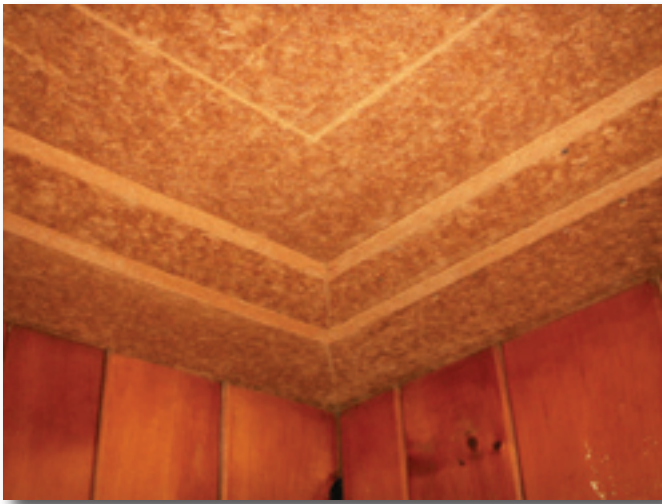
Figure 3—This fiberboard ceiling in the Butte Falls Ranger Station (Rogue River-Siskiyou National Forest, Pacific Northwest Region) has been carved into a decorative pattern. The ceiling is the natural brown color of the wood pulp from which it was manufactured.