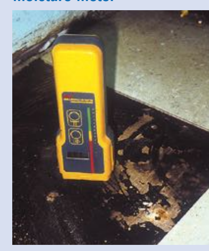
Photo 9: Moisture meter measuring moisture content of plywood subfloor