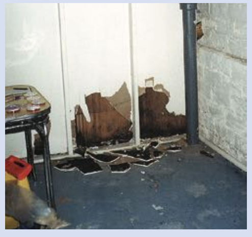
Photo 3B: Front side of wallboard looks fine, but the back side is covered with mold