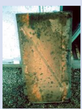
Photo 4A: Contaminated fibrous insulation inside air handler cover

Do not run the HVAC system if you know or suspect that it is contaminated with mold. If you suspect that it may be contaminated (it is part of an identified moisture problem, for instance, or there is mold growth near the intake to the system), consult EPA's guide Should You Have the Air Ducts in Your Home Cleaned? <sup>4</sup> before taking further action (see Resources List).