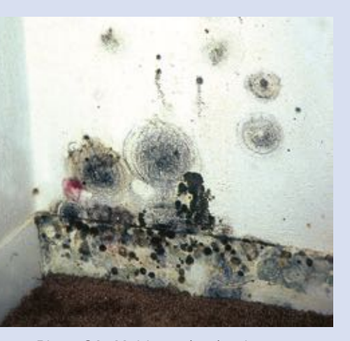
Photo 3A: Mold growing in closet as a result of condensation from room air