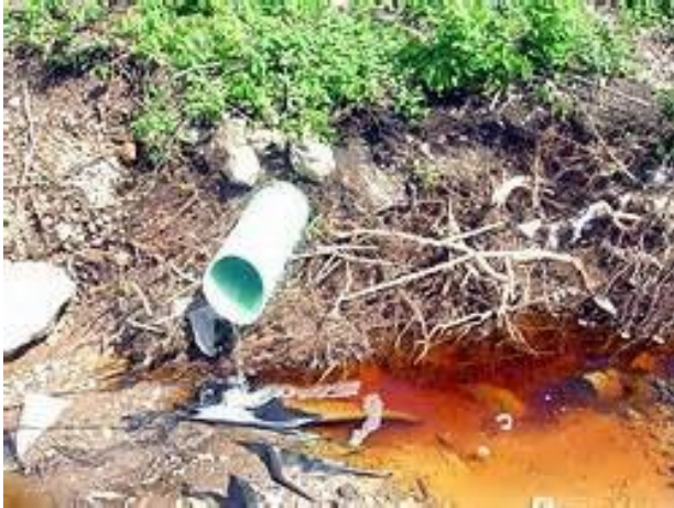
Fig 3. Illicit sewage discharge to a ditch.

For waterbodies and groundwater that are near failing septic systems, the nutrient concentrations will increase. A recent study by Michigan State University (MSU) found that all 64 rivers that they sampled in Michigan had human-specific, digestive bacteria present in them, indicating that human waste was a pollutant to the surface waters. Further analysis by MSU revealed that septic systems were the largest contributors of the human waste bacteria. E. coli bacteria contamination to surface waters is typically the most immediate concern with failing septic systems. However, a failing septic system will also contribute nutrients to local surface waters as well. In some cases, failing septic systems, or septic systems with inadequate drainfields can be the largest contributors of nutrients to a waterbody. A recent study by the United States Geologic Survey and Grand Valley State University that examined nutrient sources to a eutrophic lake in west Michigan found that septic systems of the homes along the lake were the biggest contributor of nutrients.