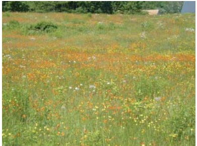
[The photograph shows a field of wildflowers in northern Vermont.] Wildflowers and ordinary grasses are just fine for planting over a

NOT OK for use over a septic drainfield: these plants will reduce effluent evaporation from the mound soils and because their roots often invade and clog effluent distribution piping. The photograph shows typical ground cover north of the arctic circle in Iceland. Thick dense vegetation of any sort will conserve moisture to itself and will prevent soil transpiration. Over a septic system this means that the portion of effluent disposal that is supposed to be occurring due to evaporation will be reduced and the liquid load on surrounding soils increased - you've cut the effectiveness and shortened the life of the drainfield by such plantings. These plants are OK, however, for planting over the septic tank itself.