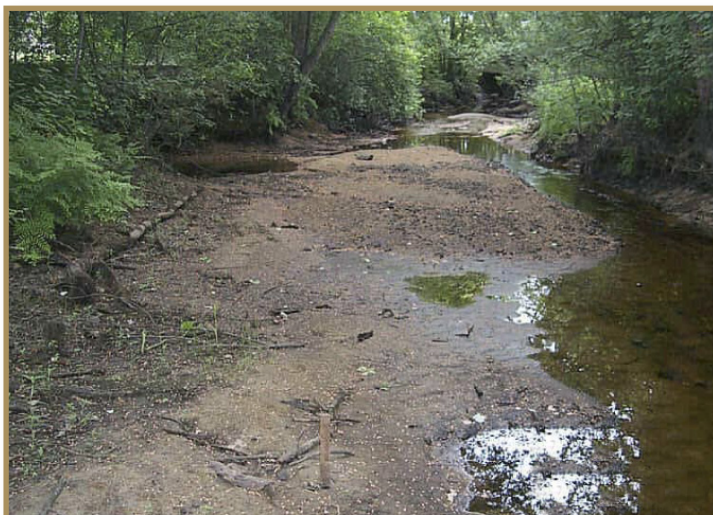
The Ipswich River

Communities facing some or all of these problems can benefit from Water Resource Management Planning. Water Resource Management Planning enables cities and towns to select the most environmentally appropriate and cost effective means of meeting their wastewater, drinking water and stormwater management needs.