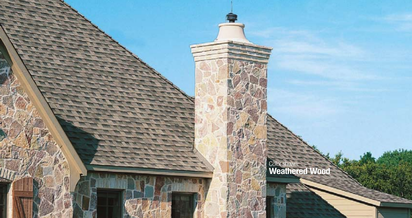
Color shown: Weathered Wood