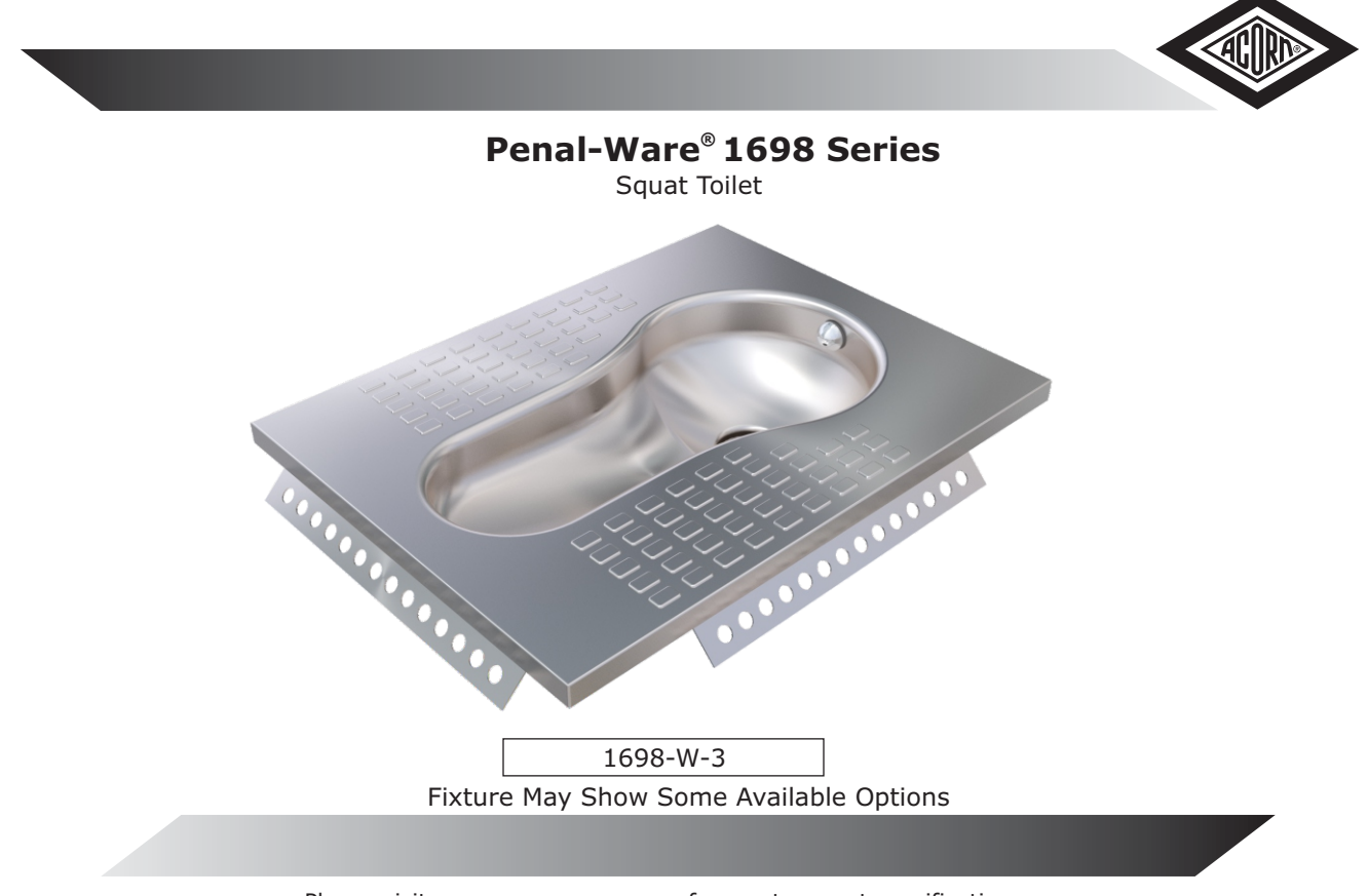
Please visit www.acorneng.com for most current specifications.