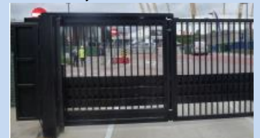
Bi-Folding Speed Gate.