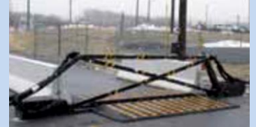
Mobile Net Barrier. Source: NeuSecurity