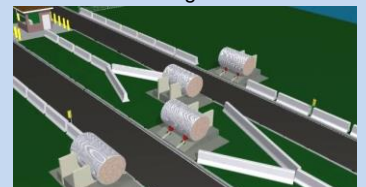
Semi-manual Barrier.