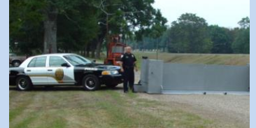
Portable Wedge.