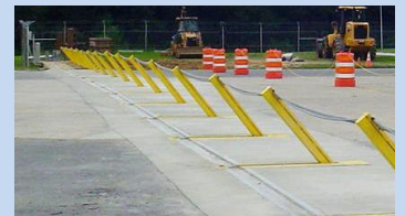
Electric Cable Trap.

Drives: hydraulic, pneumatic, electric (including battery), friction / gravity-drive, manual