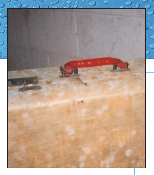
Mold growing on a suitcase stored in a humid basement.