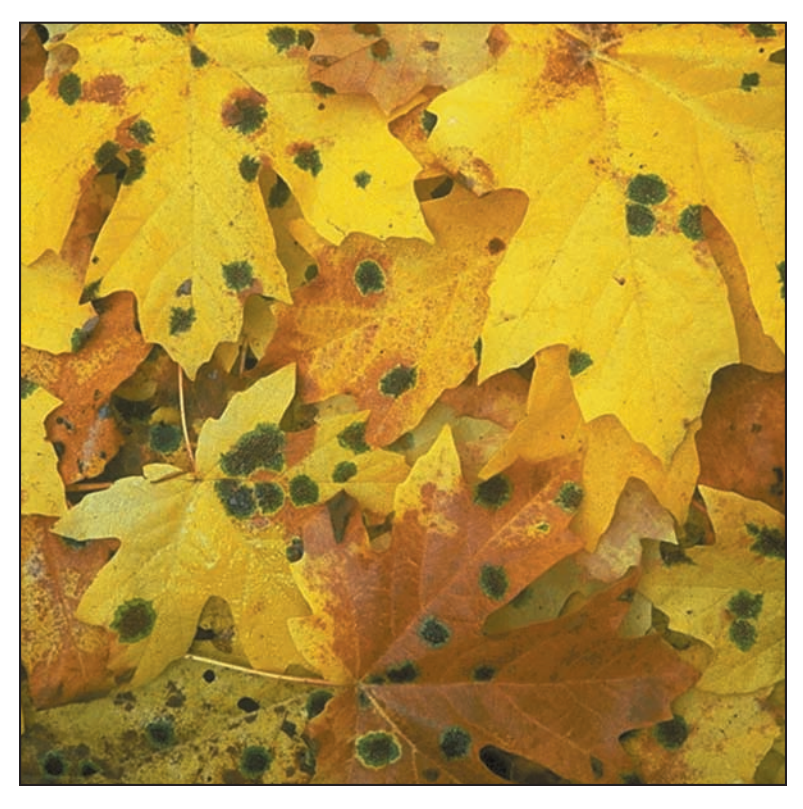
Mold growing on fallen leaves.

This document is available on the Environmental Protection Agency, Indoor Environments Division website at: www.epa.gov/mold