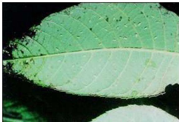
Figure 2. Aphids on undersurface of black walnut leaflet.

Sooty mold growth is of two types. The first is a deciduous growth on leaves, which lasts for the life of the leaf. The second is persistent growth on stems and twigs of woody plants and on humanmade structures. In this type, growth is renewed from existing mycelium of the fungi produced the previous season.