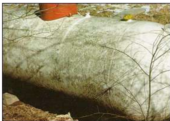
Figure 3. Propane tank under black walnut tree with sooty mold growth on it.

Sooty mold coverings on leaves block light, making photosynthesis less efficient. On outdoor structures and furniture, sooty mold growths are unsightly and may be difficult to remove (figs. 3-6). Many people are allergic to sooty molds, particularly the Cladosporium and Aureobasidium components common in sooty molds of the Eastern U.S.