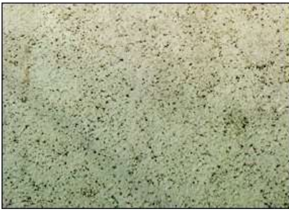
Figure 4. Closeup of sooty mold colonies on surface of propane tank.