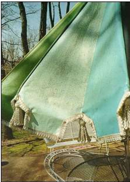
Figure 5. Sooty mold growth on surface of patio umbrella located below black oak trees.