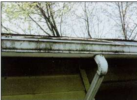
Figure 6. Sooty mold growth on house rain gutter located below a silver maple tree.