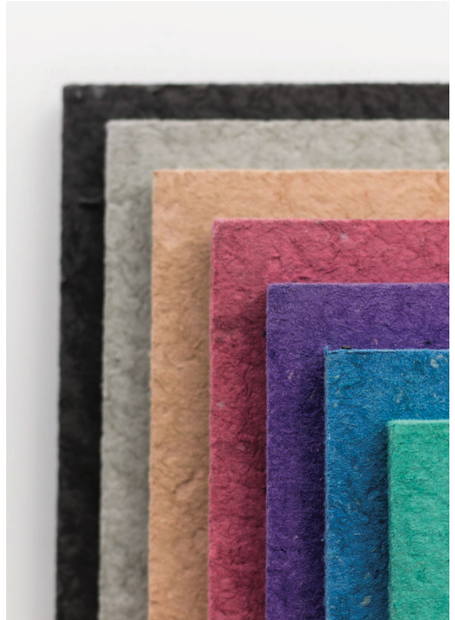
Square edge cut Sundeala K Board.