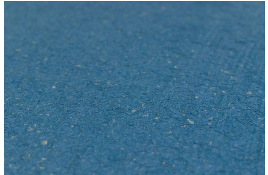
Sundeala K Board, long lasting surface integrity.

Sundeala K Board is 'School Safe' and consistently retains even the slimmest of pins, meaning that displays put up with a staple gun will hold firmly in place, eliminating the need for pins and tacks around small children and ensuring that the school environment remains safe from sharp objects.