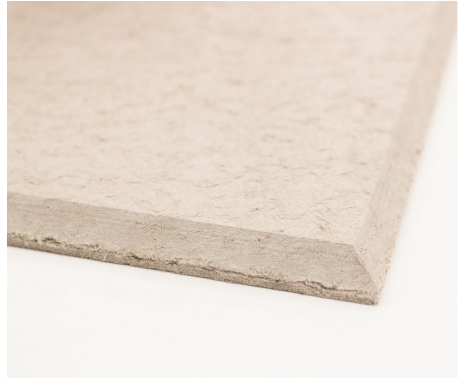
Bevelled edge natural colour-way.

The fibres that comprise Sundeala K Board are broken down using water from the local river then pressed and dried to produce a robust, rigid board. Water pressed from the board is recycled back into the process and is the only by-product of the manufacturing process, which returns to the natural water cycle.