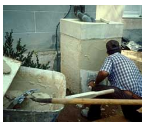
The deteriorated surface of this catch basin is being re-stuccoed.

After the cause of deterioration has been identified, any necessary repairs to the building should be made first before repairing the stucco. Such work is likely to include repairs designed to keep excessive water away from the stucco, such as roof, gutter, downspout and flashing repairs, improving drainage, and redirecting rainwater runoff and splash-back away from the building. Horizontal areas such as the tops of parapet walls or chimneys are particularly vulnerable to water infiltration, and may require modifications to their original design, such as the addition of flashing to correct the problem.