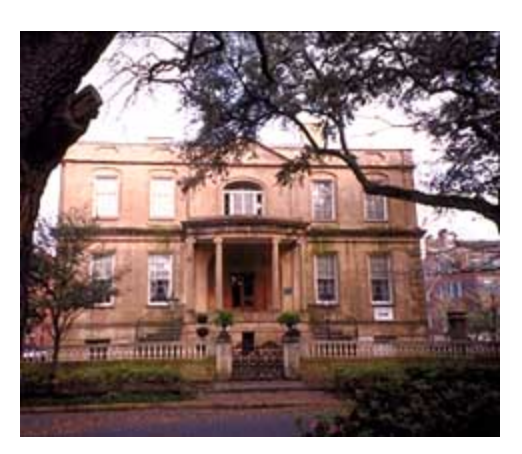
The stucco on the early-19th century Richardson-Owens-Thomas House in Savannah, Georgia, is a type of natural cement.

Stucco has been used since ancient times. Still widely used throughout the world, it is one of the most common of traditional building materials. Up until the late 1800's, stucco, like mortar, was primarily limebased, but the popularization of portland cement changed the composition of stucco, as well as mortar, to a harder material. Historically, the term "plaster" has often been interchangeable with "stucco"; the term is still favored by many, particularly when referring to the traditional lime-based coating. By the nineteenth century "stucco," although originally denoting fine interior ornamental plasterwork, had gained wide acceptance in the United States to describe exterior plastering. "Render" and "rendering" are also terms used to describe stucco, especially in Great Britain.