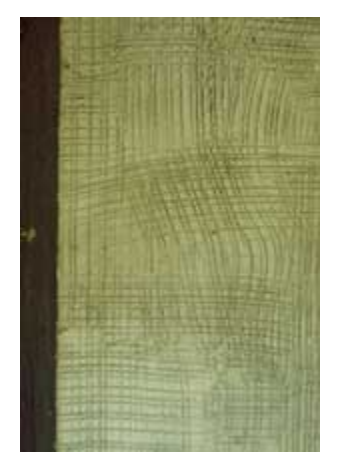
The final finish coat will be applied to this scratch coat.

A stucco mix compatible with the historic stucco should be selected after analyzing the existing stucco. It can be adapted from a standard traditional mix of the period, or based on one of the mixes included here. Stucco consisting mostly of portland cement