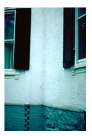
This stucco house has a rough cast finish.

The most common early-twentieth century stucco finishes are often found on bungalow-style houses, and include: spatter or spatterdash (sometimes called roughcast, harling, or wetdash), and pebble-dash or drydash. The spatterdash finish is applied by throwing the stucco mortar against the wall using a whisk broom or a stiff fiber brush, and it requires considerable skill on the part of the plasterer to achieve a consistently rough wall surface. The mortar used to obtain this texture is usually composed simply of a regular sand, lime, and cement mortar, although it may sometimes contain small pebbles or crushed stone aggregate, which replaces one-half the normal sand content. The pebble-dash or drydash finish is accomplished manually by the