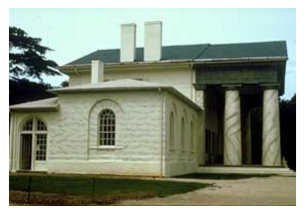
Arlington House, Arlington, Virginia.

structures throughout the United States. It is so common, in fact, that it frequently goes unnoticed, and is often disguised or used to imitate another material. Historic stucco is also sometimes incorrectly viewed as a sacrificial