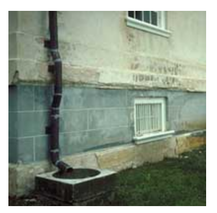
The damage to this stucco appears to be caused by moisture infiltration.