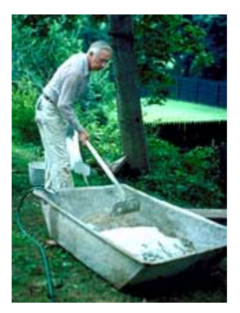
The dry materials must be mixed thoroughly before adding water to make the stucco.

Like interior wall plaster, stucco has traditionally been applied as a multiple-layer process, sometimes consisting of two coats, but more commonly as three. Whether applied directly to a masonry substrate or onto wood or metal lath, this consists of a first "scratch" or "pricking-up" coat, followed by a second scratch coat, sometimes referred to as a "floating" or "brown" coat, followed finally by the "finishing" coat. Up until the late-nineteenth century, the first and the second coats were of much the same composition, generally consisting of lime, or natural cement, sand, perhaps clay, and one or more of the additives previously mentioned. Straw or animal hair was usually added to the first coat as a binder. The third, or finishing coat, consisted primarily of a very fine mesh grade of lime and sand, and sometimes pigment. As already noted, after the 1820s, natural cement was also a common ingredient in stucco until it was replaced by portland cement.