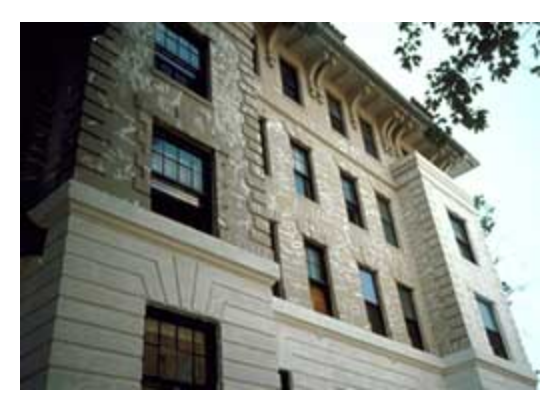
Caulking is not an appropriate method for repairing cracks in historic stucco.

The composition of stucco depended on local custom and available materials. Stucco often contained substantial amounts of mud or clay, marble or brick dust, or even sawdust, and an array of additives ranging from animal blood or urine, to eggs, keratin or gluesize (animal hooves and horns), varnish, wheat paste, sugar, salt, sodium silicate, alum, tallow, linseed oil, beeswax, and wine, beer, or rye whiskey. Waxes, fats and oils were included to introduce water-repellent properties, sugary materials reduced the amount of water needed and slowed down the setting time, and alcohol acted as an air entrainer. All of these additives contributed to the strength and durability of the stucco.