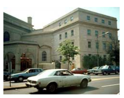
The new addition on the right is stucco scored to imitate the limestone of the historic building on the left.

The color of most early stucco was supplied by the aggregate included in the mix—usually the sand. Sometimes natural pigments were added to the mix, and eighteenth and nineteenth-century scored stucco was often marbleized or painted in imitation of marble or granite. Stucco was also frequently coated with whitewash or a colorwash. This tradition later evolved into the use of paint, its popularity depending on the vagaries of fashion as much as a means of concealing repairs. Because most of the early colors were derived from nature, the resultant stucco tints tended to ne mostly earth-toned. This was true until the advent of brightly colored stucco in the early decades of the twentieth century. This was the so-called "Jazz Plaster"