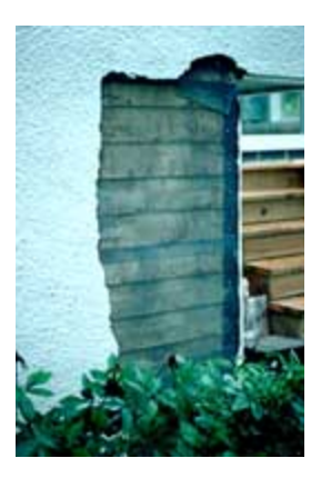
The stucco will be applied to the wire lath laid over the area to be patched.

In the interest of saving or preserving as much as possible of the historic stucco, patching rather than wholesale replacement is preferable. When repairing heavily textured surfaces, it is not usually necessary to replace an entire wall section, as the textured finish, if well-executed, tends to conceal patches, and helps them to blend in with the existing stucco. However, because of the nature of smoothfinished stucco, patching a number of small areas scattered over one elevation may not be a successful repair approach unless the stucco has been previously painted, or is to be painted following the repair work. On unpainted stucco such patches are hard to conceal, because they may not match exactly or blend in with the rest of the historic stucco surface. For this reason it is recommended, if possible, that stucco repair be carried out in a contained or well-defined area, or if the stucco is scored, the repair patch should be "squared-off" in such a way as to follow existing scoring. In some cases, especially in a highly visible