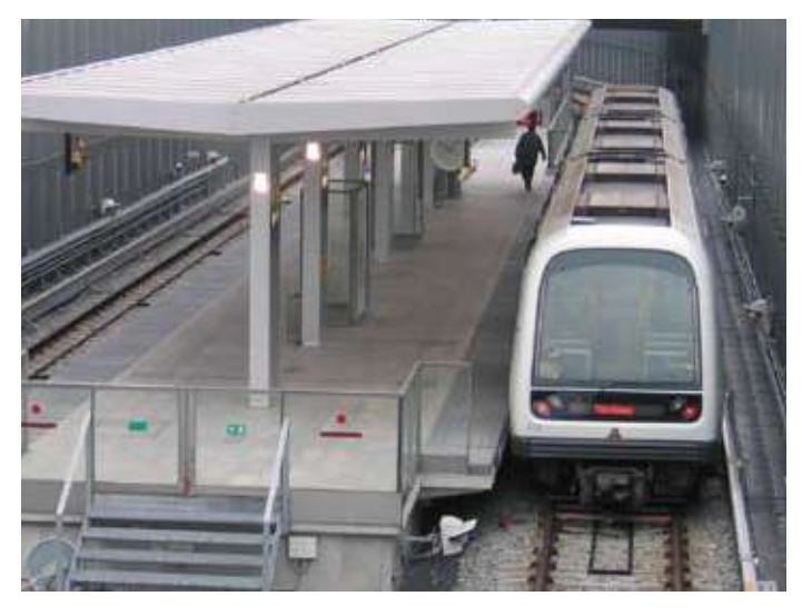
Copenhagen Metro – using RockDelta® anti-vibration mats