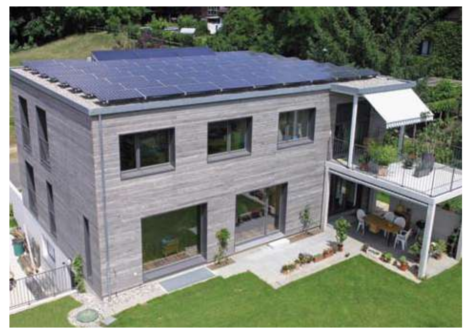
Newly built double family house, Riehen, Switzerland (Setz Architektur, Switzerland)

Two examples from Switzerland illustrate even further reductions in energy demand. The first example from Basel shows how a multiple family home was renovated so that it needs zero energy for heating, hot water and air ventilation system with heat recovery.