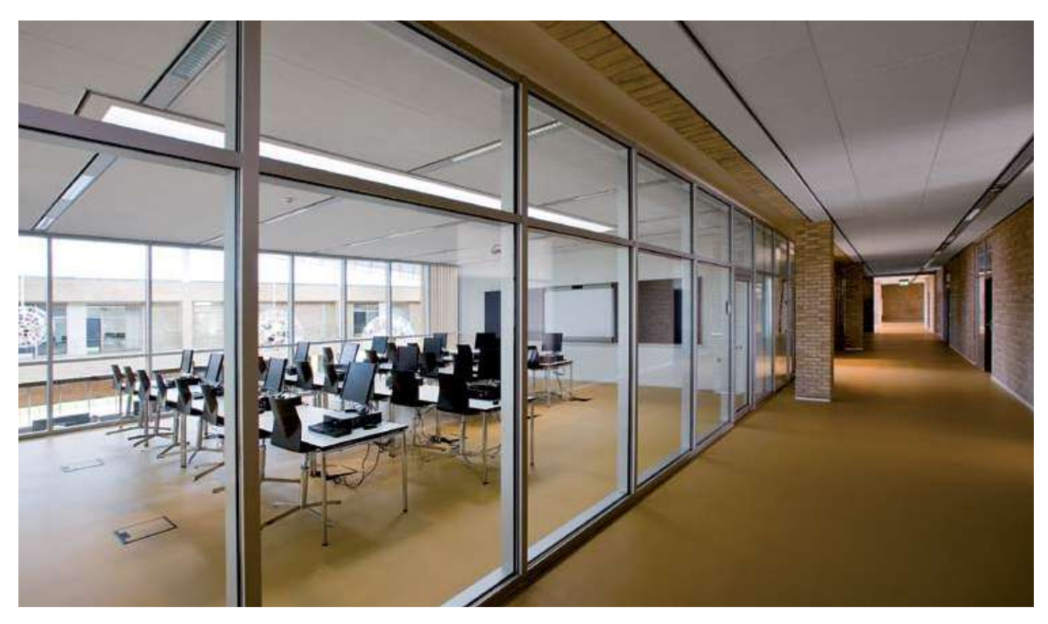
Classroom at A.P. Moller School, Schleswig, Germany, using Rockfon® ceiling tiles

A good wall construction using Rockwool insulation will help reduce noise transmission by more than 50 decibels (dB) – approximately 20 dB more than a construction without insulation. To put this in context, to humans, a 10 dB difference is heard as a doubling (or halving) of the audible sound (Climate & Environment).