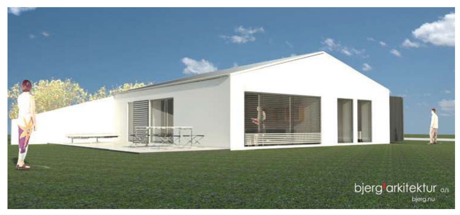
Passivhaus, Hjørring, Denmark