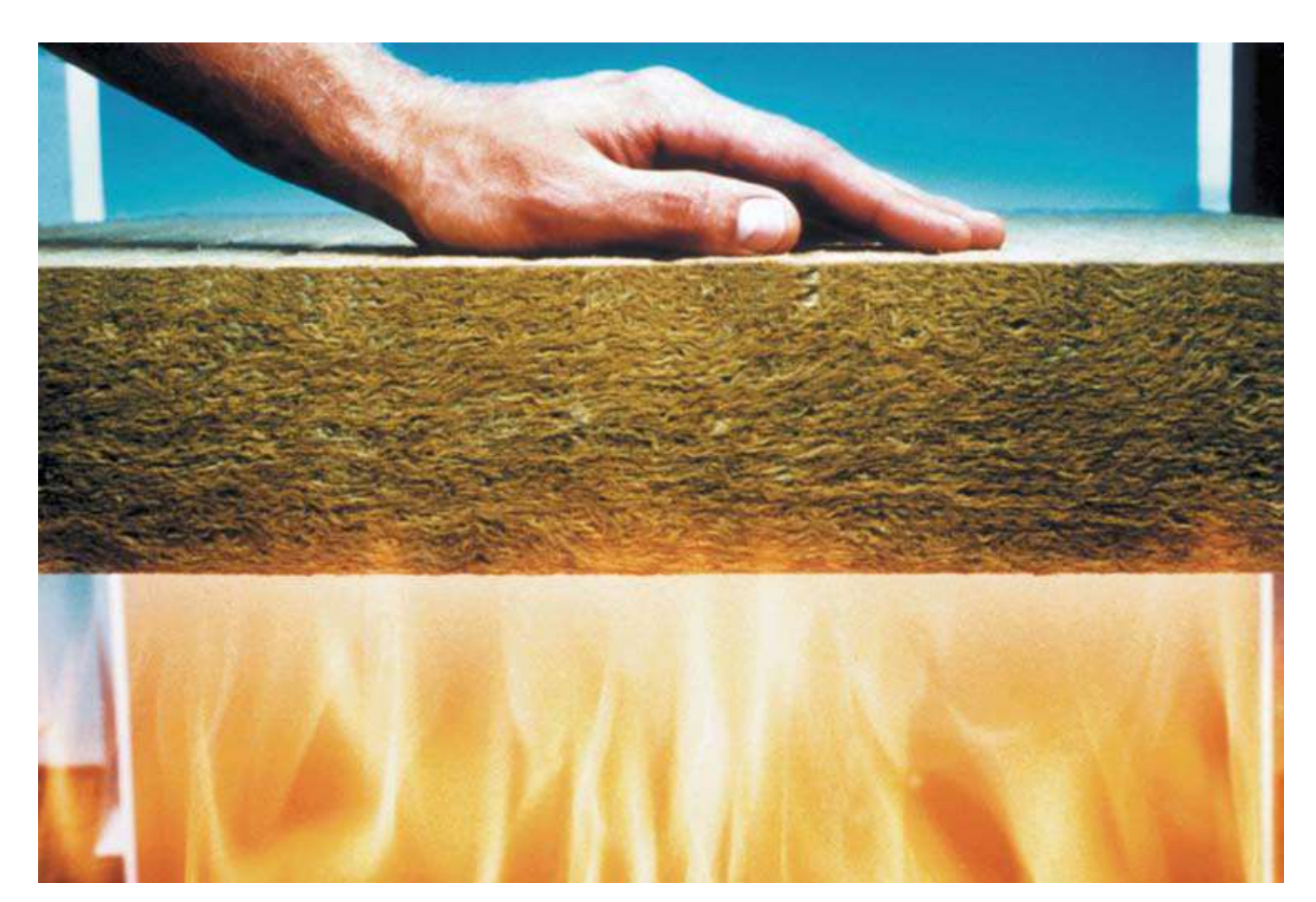
Fire-retardant properties of Rockwool stone wool