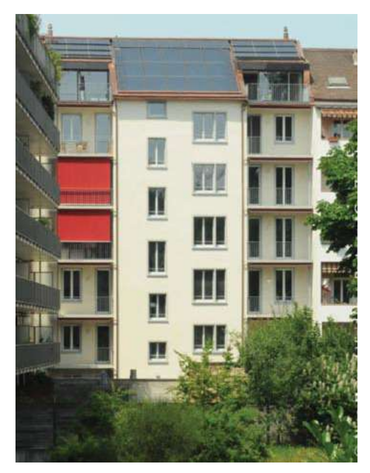
Renovated multiple family home, Basel, Switzerland (Viridén + Partner AG, Zurich)

As the name implies, measures necessary to achieve a Passivhaus are mainly passive. Once installed, they perform throughout the lifetime of the building without needing maintenance, except for a change of ventilation filter once or twice a year.