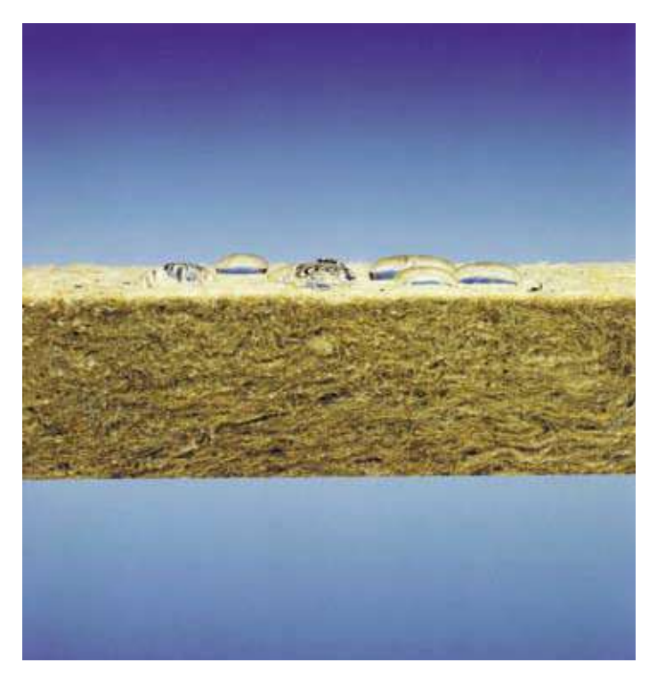
Water-repellent properties of Rockwool stone wool

Moisture and nutrients are necessary conditions for mould growth. Since more than 95% of Rockwool insulation products are made up of inorganic fibres, there is little nutrient source to allow fungal growth. Because of this and the product's water repellence, there is no need to add fungicide (Klamer et al.).