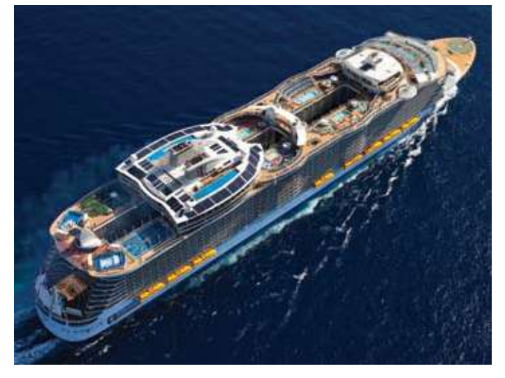
Oasis of the Seas - insulated with stone wool