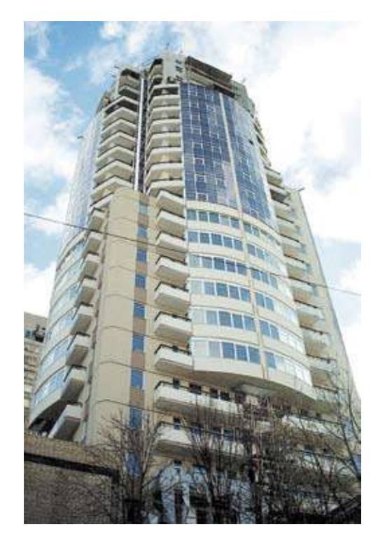
Innovation Centre Lincoln, UK equipped with Rockpanel® chameleon cladding