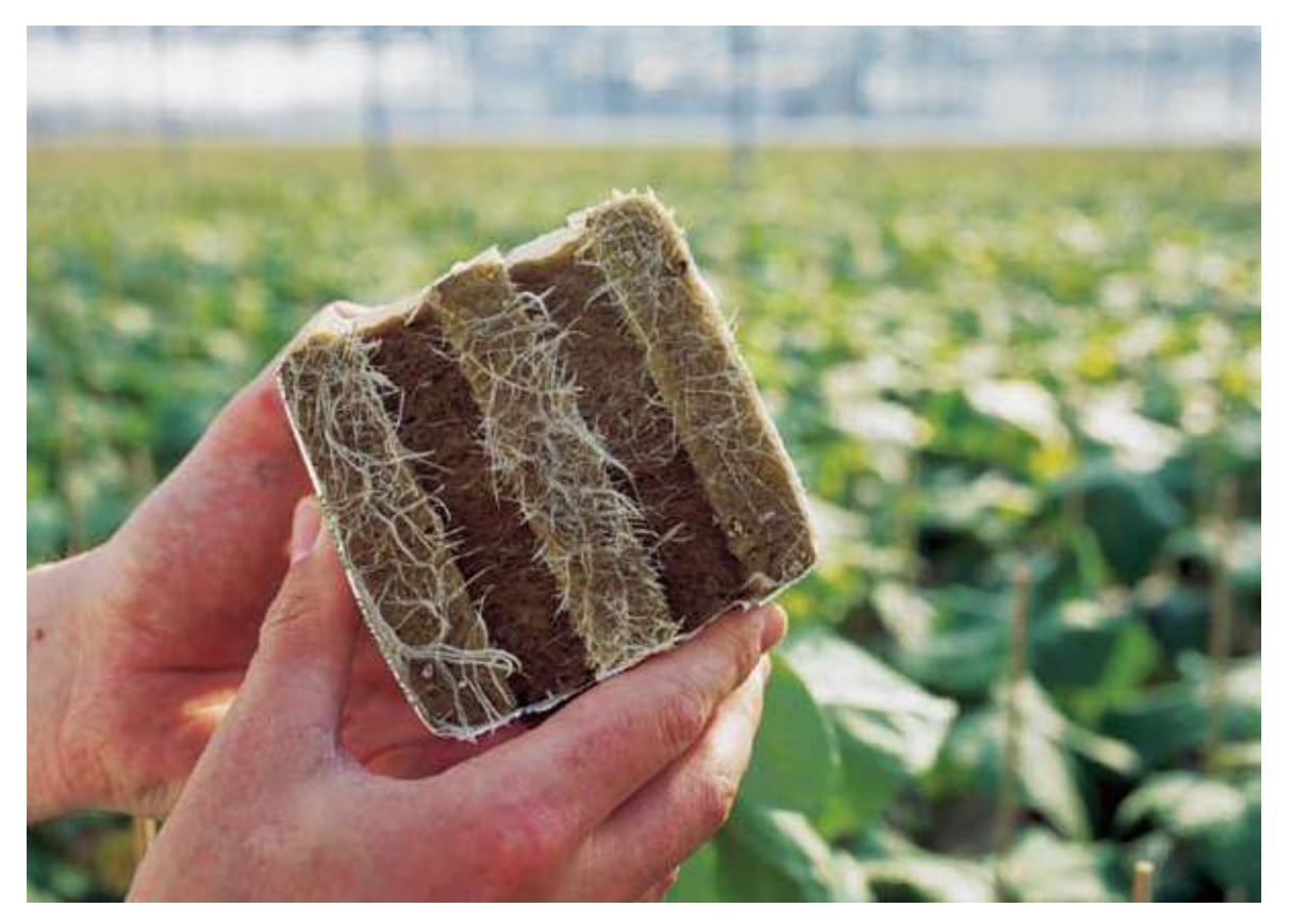
Greenhouse using Grodan® products for growing cucumbers

The Rockwool Group has approximately 8,000 employees in more than 30 countries – and customers all over the world. The group has been producing stone wool for more than 70 years and has currently 21 factories across Europe, North America and Asia (Climate & Environment).