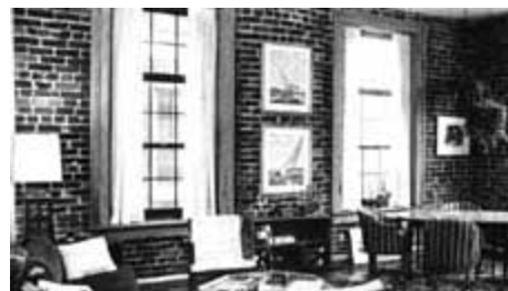
Plaster has been removed from perimeter walls, leaving brick exposed. The plaster should have been retained and repaired, as necessary.

8. Avoid "furring out" perimeter walls for insulation purposes. This requires unnecessary removal of window trim and can change a room's proportions. Consider alternative means of improving thermal performance, such as installing insulation in attics and basements and adding storm windows.