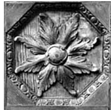
Detail of carving on interior shutter. Hammond-Harwood House, Annapolis, Maryland.

Interior components worthy of preservation may include the building's plan (sequence of spaces and circulation patterns), the building's spaces (rooms and volumes), individual architectural features, and the various finishes and materials that make up the walls, floors, and ceilings. A theater auditorium or sequences of rooms such as double parlors or a lobby leading to a stairway that ascends to a mezzanine may comprise a building's most important spaces. Individual rooms may contain notable features such as plaster cornices, millwork, parquet wood floors, and hardware. Paints, wall coverings, and finishing techniques such as graining, may provide color, texture, and patterns which add to a building's unique character.