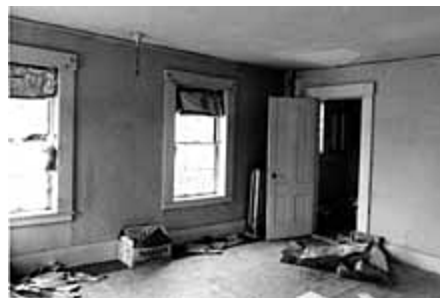
The interior of this 19th worker's house has not been properly maintained, but it may be as important historically as a richly ornamented interior. Its wide baseboards, flat window trim, and four-panel door should be carefully preserved in a rehabilitation project.

In addition to evaluating the relative importance of the various spaces, the assessment should identify architectural features and finishes that are part of the interior's history and character. Marble or wood wainscoting in corridors, elevator cabs, crown molding, baseboards, mantels, ceiling medallions, window and door trim, tile and parquet floors, and staircases are among those features that can be found in historic buildings. Architectural finishes of note may include grained woodwork, marbleized columns, and plastered walls. Those features that are characteristic of the building's style and period of construction should, again, be retained in the rehabilitation.