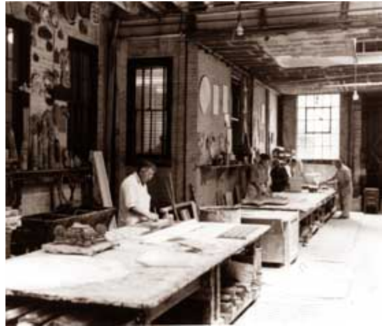
This plaster studio is well organized, with ample work space. Note the plaster casts hanging neatly on the wall.

look around and ask questions. What is the shop's past project work experience? Is the firm mostly involved in new construction work or total reconstruction? More important than the way the shop looks, is the personnel sufficiently experienced in making repairs to historic decorative plaster? What about training and apprenticeships? How did the staff learn the trade? The more that is known about the total operation the better.