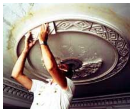
Running and enriching a ceiling medallion.

From the time America struggled for a new identity as a constitutional republic—and well into the 20th century—its architecture and its decorative detailing remained firmly rooted in the European classicism of Palladio, Wren, and Mansart. Together with skilled masons and carpenters, ornamental plasterers saw their inherited trade flourish from the mid-18th century until the Depression years of the 1930s. During this two hundred year period, as the Georgian and Federal styles yielded to the revivals—Greek, Rococo, Gothic, Renaissance, and Spanish—decorative plaster reflected each style, resulting in the wide variety of ornamentation that survives. The traditional methods of producing and installing interior decorative plaster were brought from Europe to this country intact and its practice remains virtually unchanged to this day.