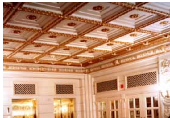
The elaborate coffered ceiling was designed for the Willard Hotel in Washington, D.C. (1902-04) by Henry Janeway Hardenbergh. It was restored as part of a rehabilitation project in the 1980s.