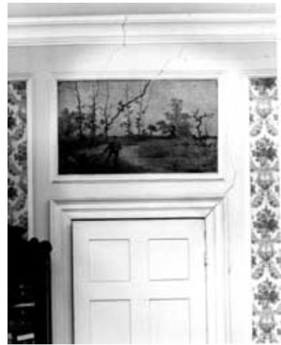
Settlement caused stress cracking through both flat wall and ornamental plaster. Repairs to the cornice molding involve chamfering the stress cracks to a "V groove," and patching with a mixture of gypsum and lime.