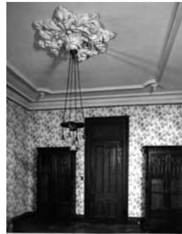
This parlor medallion and pendant drops shown in a mid-19th century house in Annapolis, Maryland, were originally ordered from a catalog.

Unfortunately, these supposedly enduring decorative forms created by ornamental plaster tradesmen are subjected to the ravages of both nature and man and, consequently, seldom remain as originally designed. Minor changes of taste are perhaps the least injurious to plasterwork. Considerably greater damage and deterioration are caused by radical changes in building use and poor maintenance practices. Fortunately, in most cases, the form, detailing, and finish of historic ornamental plaster can be recaptured through careful repair and restoration.