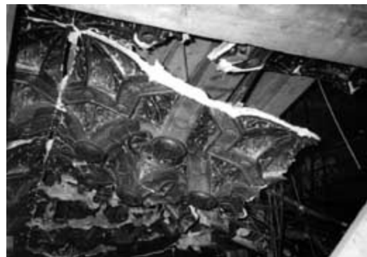
The Yiddish Arts Theater, New York City, c. 1920s. The concrete roof of this building had collapsed, damaging portions of the existing Moorish style coffered ceiling. The square coffer unit was easily identifiable and was removed to a casting shop for reproduction.

Coffered ceilings appear with plain run or enriched cornices. In most cases it is recommended that the cornice be repaired first in order to achieve straight and level moldings. Then the damaged coffers should be replaced with the matching new coffers and the joints between pointed. Access from above is critical.