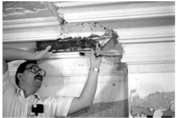
Mitering a plain-run cornice requires great dexterity using the miter rod.