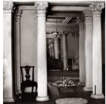
These Greek Revival columns (Gaineswood, Demopolis, Alabama, c. 1842-60) were drawn from Minard Lafever's Beauties of Modern Architecture of 1835. This bold new style began in New York City and quickly spread south and west.

Decorative plasterwork is usually a component of the historic character of interiors and, consequently, The Secretary of the Interior's Standards for Historic Preservation Projects call for its protection, maintenance, and repair. Where decorative plasterwork has deteriorated beyond repair, it should be replaced to match the old. Based on physical documentation, both repair and replacement can be accomplished using traditional molding plaster and casting procedures, together with the best of the modern molding materials available. Once a "lost