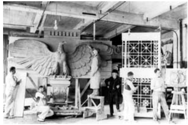
Ornamental plaster studios employed a variety of personnel, including sculptors who modelled in clay; casters who made production units; and finishers who cleaned the casts.

plasterwork in new construction. Finally, guidance on using substitute materials to match the historic appearance of ornamental plasterwork—a legitimate option within the Secretary of Interior's Standards for the Treatment of Historic Properties—is not discussed here, but will be the subject of another Brief on interiors.