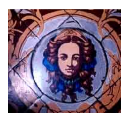
This Minton encaustic floor tile was installed in the U.S. Capitol in the 1850s.

With a tradition that dates to ancient civilizations, *ceramic tile flooring can be found in a variety of settings in diverse cultures and structures, including residential buildings ranging from large apartment buildings to small private houses, institutional buildings such as government offices and schools, and religious buildings such as cathedrals and mosques. Historically, its widespread use may be attributed to the fact that a readily available natural material—clay—could be converted by a relatively simple manufacturing process—baking or firing—into a very durable, long-lasting and attractive floor tile that is easy to maintain. Ceramic floor tiles exhibit a versatility of colored glazes and