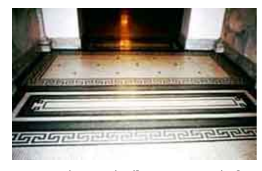
Ceramic mosaic tiles are a practical floor covering in the entryway of this early 20th century school building.

During the 20th century, the floor tile industry continued to evolve as much as it had in the previous century. Modern methods of production employed sophisticated machinery, new materials and decorating techniques. In the years following World War II, there were many advances in the industry. Commercially manufactured dust-pressed tiles, which had previously required more than 70 hours just in the kiln, could be made in less than two hours from the raw material stage to finished tiles, boxed and ready to ship. Dried, unglazed tiles were sprayed with colored glaze evenly and automatically as conveyors carried the tiles into the tunnel kilns, and the