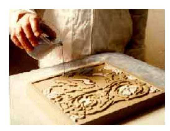
Colored slip, or liquid clay, is being poured into the indented portion of a reproduction encaustic tile, to create the pattern.

There are several methods used for making ceramic tiles: extrusion; compaction or dust-pressing; cutting from a sheet of clay; or molded in a wooden or metal frame. Quarry tiles are extruded, but most ceramic floor tiles, including traditional encaustic, geometric and ceramic "mosaic" tiles are made from refined and blended ceramic powders using the compaction method, known as dust-pressing. Encaustic tiles, which were made by dust-pressing, are unique in that their designs are literally "inlaid"into the tile body, rather than surface-applied. Once formed, tiles are dried slowly and evenly to avoid warpage, then fired in a special kiln that controls high, even heat at temperatures up to 1200°C (or approximately