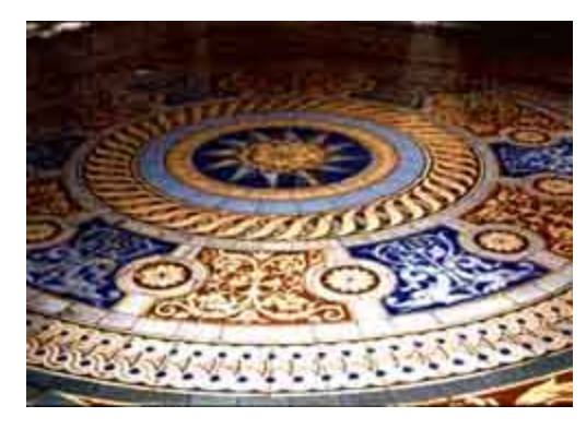
Encaustic floor tiles were decorated with traditional as well as original designs. Over time, the decorations can be worn thin by heavy traffic.

pattern on top. After the tile dried, colored slip (liquid white clay colored with dyes), was poured to fill in the intaglio pattern. Each color had to dry before another color of slip was added. The recessed area was overfilled to allow for shrinkage, and after drying for several days, and before firing, the excess slip was scraped off the surface by a rotating cutter that created a flat, although not completely smooth, face. Problems might arise during the firing. Due to the dissimilar rates of contraction of the different clays, the inlaid clay could shrink too much and fall out of the tile recesses; or, the tile could be stained by the different pigments used for the design if impure or unstable.