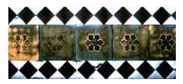
Worn encaustic tiles are still serviceable, but once the design has been lost, the tiles cannot be repaired. They must be replaced in kind, to match.