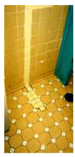
This inappropriate ceramic tile repair is easy to spot.

In limited instances, glaze failure or surface powdering of ceramic floor tiles may sometimes be treated successfully by a conservator with a specially formulated, solvent-based, mineral densifying agent (such as silicic acid), followed by a siloxane sub-surface repellent, applied 24 hours later. Under the right circumstances, such a treatment can harden and bind the surface, and lower the absorbency of the tile, and still maintain the vapor transmission. But this is a highly complex undertaking and should only be attempted by a conservator after appropriate testing. Not only are these chemicals highly toxic and dangerous to handle, but if used improperly, they can cause greater damage to the tile!