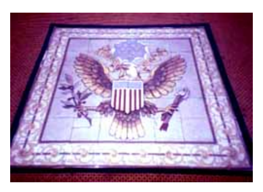
This tiled Presidential seal was laid in the floor of the Pension Building in 1901 at President McKinley's 2nd inaugeration.

experience in this field be consulted. This will ensure that all future work, whether it be regularly-scheduled maintenance or more technical and specialized repair and restoration, is done in accordance with The Secretary of the Interior's Standards for the Treatment of Historic Properties .