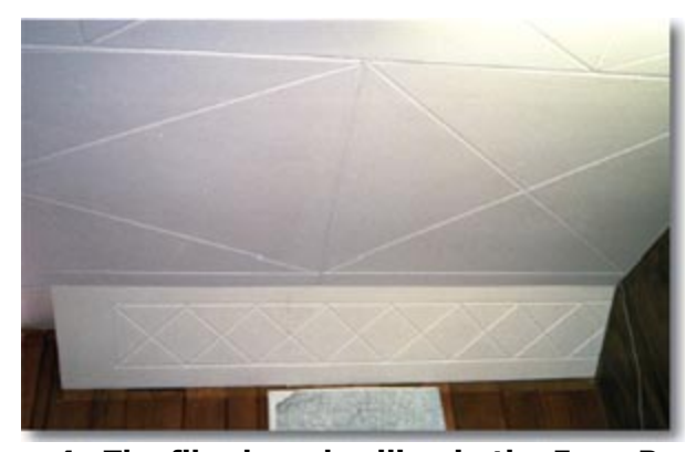
Figure 4—The fiberboard ceiling in the Fenn Ranger Station office (Moose Creek Ranger District, Nez Perce National Forest, Northern Region) has been carved and painted.

While the thickness of insulation board ranged from 3/8 to 1 inch, Forest Service guidebooks often recommended ½-inch insulation board for facilities. Sheets were 4 to 8 feet wide and could be up to 16 feet long. Panels used as insulating lath under plaster