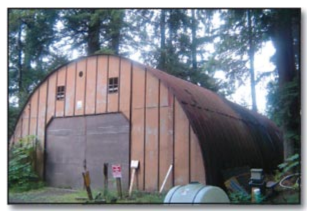
Figure 6—Masonite was often used to finish the interiors of the Quonset huts that the Forest Service acquired from the military after World War II. This Quonset hut is now used for storage at the Duck Creek Administrative Site (Juneau Ranger District, Tongass National Forest, Alaska Region).