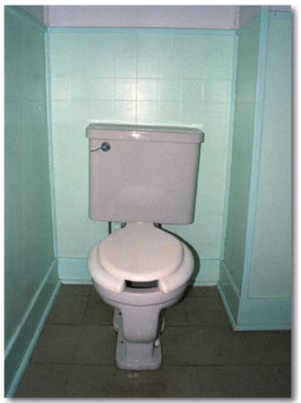
Figure 5—Temprtile, a hardboard product embossed to resemble tile, was used as a water-resistant wainscot in the cook's bathroom at the Fenn Ranger Station.

Most historic hardboard was 1/8 to 5/16 inch thick, although two boards could be glued together to make a panel that was more rigid. Masonite Corp. introduced its first hardboard in the early 1930s. The Presdwood hardboard, from 1/10 to 5/16 inch thick, was used for interior finishes and as battens over other Masonite products. Panels could be nailed or glued vertically or horizontally, then painted or wallpapered. A more durable product known as Tempered Presdwood was introduced in 1931. Often, it was screwed to studs and its joints covered with decorative battens. Temprtile, a popular choice for bathrooms and kitchens, was a Masonite water-resistant hardboard embossed to look like 4- by 4-inch tiles (figure 5).