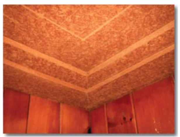
Figure 3—This fiberboard ceiling in the Butte Falls Ranger Station (Rogue River-Siskiyou National Forest, Pacific Northwest Region) has been carved into a decorative pattern. The ceiling is the natural brown color of the wood pulp from which it was manufactured.

Insulation board could be installed on interior walls and ceilings and painted or calcimined. Left unfinished, its brown face could be easily scored or cut to create interesting patterns (figure 3), and then painted to provide an easily cleaned surface (figure 4). Sheets with beveled edges were available and offered additional decorative properties. Sometimes insulation board, rather than traditional wood lath, was used to support plaster.