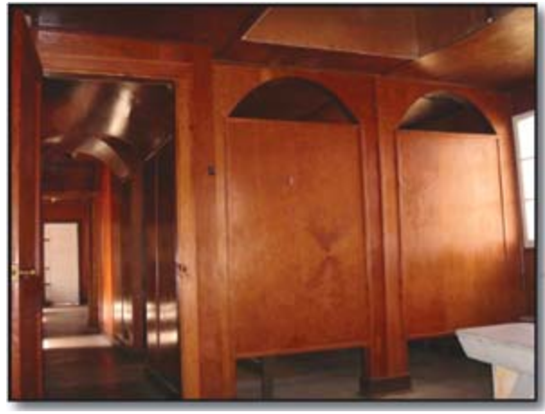
Figure 7—The interior of the infirmary at the Rabideau CCC camp (recently designated as a National Historic Landmark) is finished in varnished plywood, including curved vaults in the hallway and some rooms. Camp Rabideau is part of the Blackduck Ranger District (Chippewa National Forest, Eastern Region).

Originally limited to door panels, walls, and ceilings (<u>figure 7</u>), plywood eventually was accepted in other applications, such as sheathing and cabinetry (<u>figure 8</u>), and exterior finished surfaces.