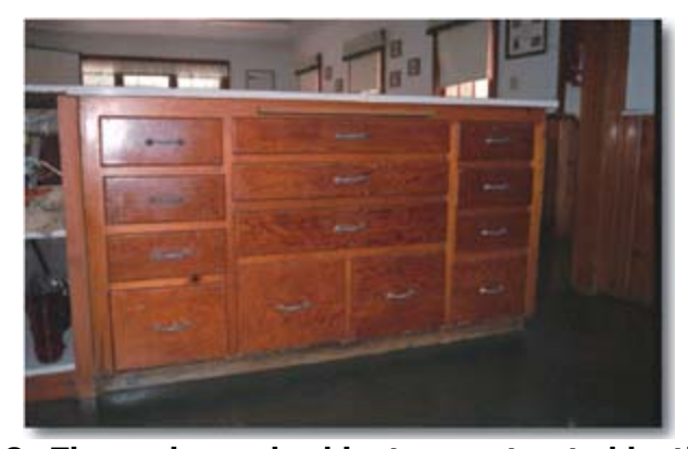
Figure 8—These plywood cabinets, constructed by the CCC in the cookhouse at the Fenn Ranger Station, are on the kitchen side of the serving counter. In this structure, cabinets visible only to the cook are plywood, while cabinets visible from the dining room are constructed of solid lumber.