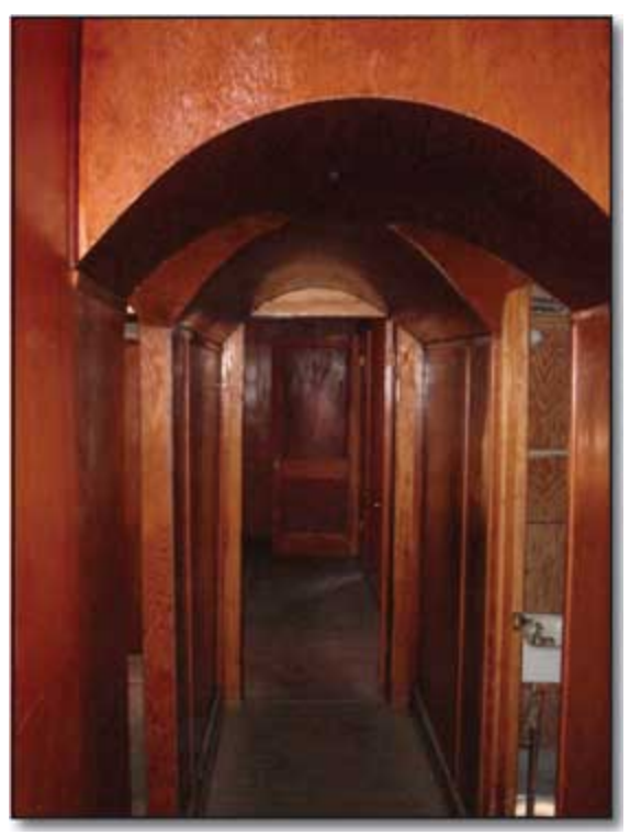
Figure 1—Varnished plywood covers the walls and ceiling of the Rabideau infirmary, which was built in 1935.

As noted in the tech tip, Early 20th-Century Building Materials: Introduction (/t-d/pubs/htm06732314/ Username: t-d Password: t-d), the Forest Service always encouraged the use of wood-based products in its facilities. As early as 1933, acceptable wall and ceiling products included fiberboard (sometimes reffered to as rigid board, building board, or wallboard) and plywood. The Washington Office's Improvement Handbook (1937) and Principles of Architectural Planning for Forest Service Administrative Improvements (1938) noted that certain fiberboards were acceptable for use as insulation and on interior walls and ceilings. These included Masonite, Nu-Wood, Du-X, and Fir-tex. To support the Forest Service's goal of using wood, fiberboards were favored as a finish material, although they were also deemed suitable as lath or base for plaster finishes.