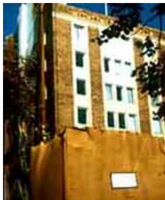
The lower floors of this historic brick and architectural terra-cotta building have been covered during chemical cleaning to protect pedestrians and vehicular traffic from potentially harmful overspray.

Concern over the release of volatile organic compounds (VOCs) into the air has resulted in the manufacture of new, more environmentally responsible cleaners and paint removers, while some materials traditionally used in cleaning may no longer be available for these same reasons. Other health and safety concerns have created additional cleaning challenges, such as lead paint removal, which is likely to require special removal and disposal techniques.