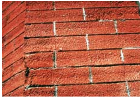
Sandblasting has permanently damaged this brick wall.