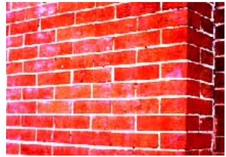
Improper cleaning methods may have been responsible for the formation of efflorescence on this brick.

Some water-repellent coatings are recommended by product manufacturers as a means of keeping dirt and pollutants or biological growth from collecting on the surface of masonry buildings and, thus, reducing the need for frequent cleaning. While this at times may be true, in some cases a coating may actually retain dirt more than uncoated masonry. Generally, the application of a water-repellent coating is not recommended on a historic masonry building as a means of preventing biological growth. Some water-repellent coatings may actually encourage biological growth on a masonry wall. Biological growth on masonry buildings has traditionally been kept at bay through regularly-scheduled cleaning as part of a maintenance plan. Simple cleaning of the masonry with low-pressure water using a natural- or synthetic-bristled scrub brush can be very effective if done on a regular basis. Commercial products are also available which can be sprayed on masonry to remove biological growth.