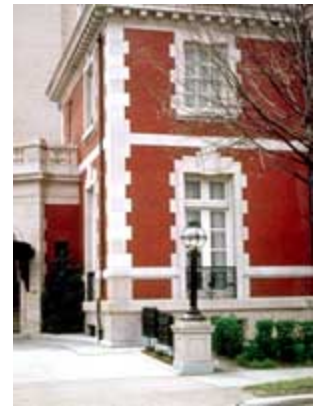
The decorative trim on this brick building is architectural terra-cotta intended to simulate the limestone foundation.

real stone. Other features on historic buildings that appear to be stone, such as decorative cornices, entablatures and window hoods, may not even be masonry, but metal.