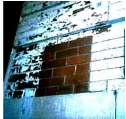
Any cleaning method should be tested before using it on historic masonry.