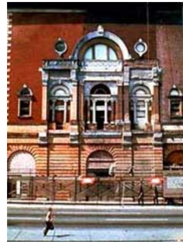
Ninety years of accumulated dirt and pollutants are being removed from this historic theater using an appropriate chemical cleaner, applied in stages.

Waterproof Coating of Masonry Buildings. The Brief is not meant to be a cleaning manual or a guide for preparing specifications. Rather, it provides general information to raise awareness of the many factors involved in selecting cleaning and water-repellent treatments for historic masonry buildings.