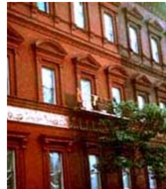
Appropriate cleaning of historic masonry.

While either or both treatments may be appropriate in some cases, they can be very destructive to historic masonry if they are not selected carefully. Historic masonry, as considered here, includes stone, brick, architectural terra cotta, cast stone, concrete and concrete block. It is frequently cleaned because cleaning is equated with improvement. Cleaning may sometimes be followed by the application of a water-repellent coating. However, unless these procedures are carried out under the guidance and supervision of an architectural conservator, they may result in irrevocable damage to the historic resource.