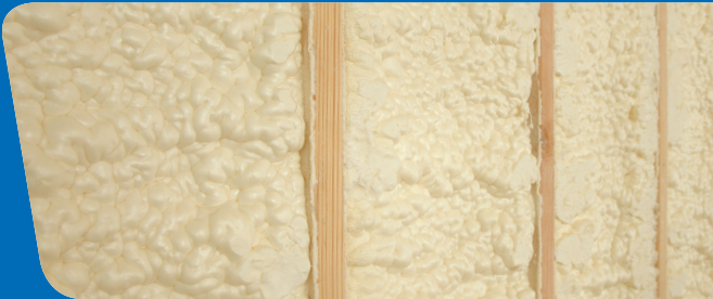
JM Corbond® Open-cell Appendix X SPF