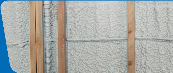
JM Corbond III® Closed-cell SPF