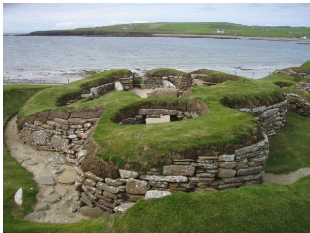
Fig. 1. The Neolithic village of Skara Brae (Orkney Island, Scotland)

construction had developed and changed dramatically over a relatively short period. New building materials emerged (cast-iron, glass structures, concrete, steel) and structural systems were planned not in empirical ways but on calculative methods [6, 7].