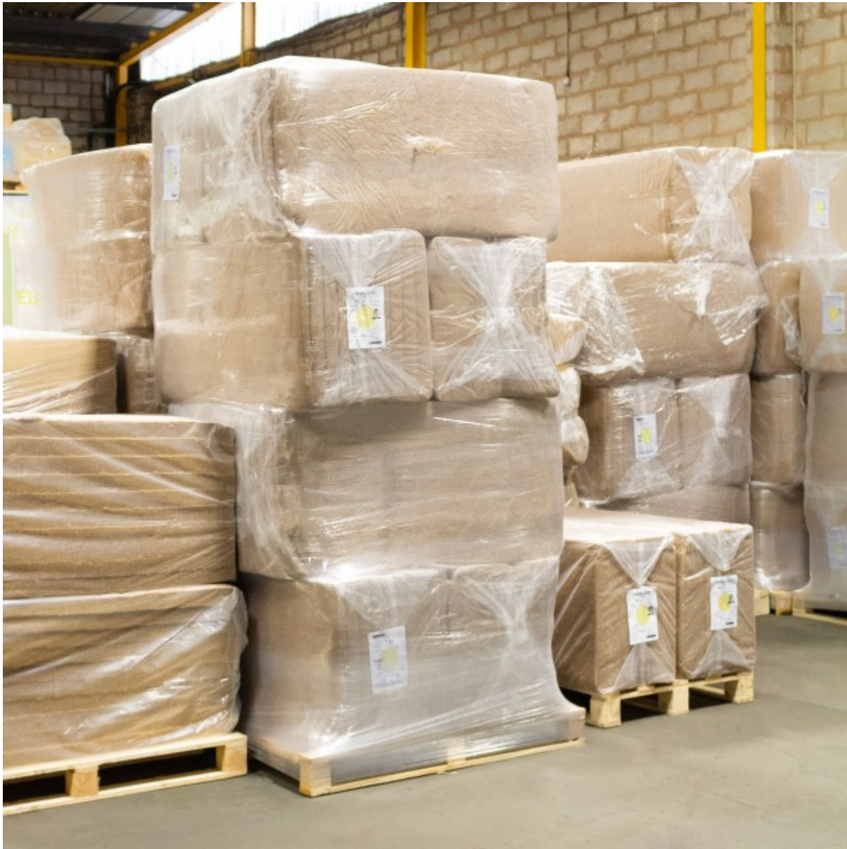
A typical pallet containing 8 packs of Thermo Hemp Combi Jute (pallet dimensions: 1.2m x 1.2m x 2.4m)