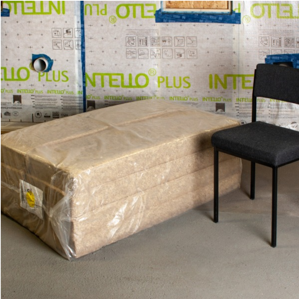
Typical size of one pack of 8 mats (100mm thick mats)