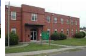
Strip Center Developments