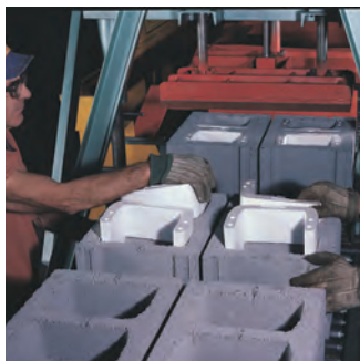
Block plant installed