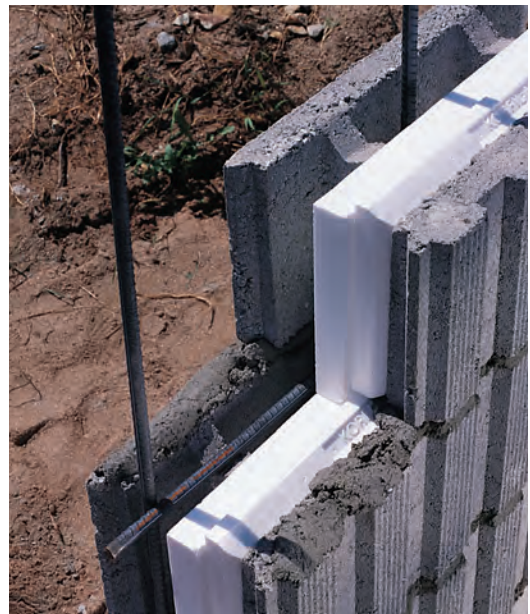
Hi-R masonry wall system with vertical and horizontal steel in place

Expanded Polystyrene Insulation, like all foamed plastic, is classified as combustible. During storage and installation, observe good fire safety practices. Blocks containing damaged or mutilated inserts will not be accepted.