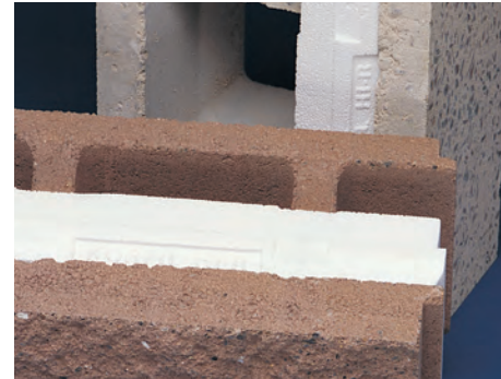
Hi-R Masonry Wall System Please see details on Page 4.