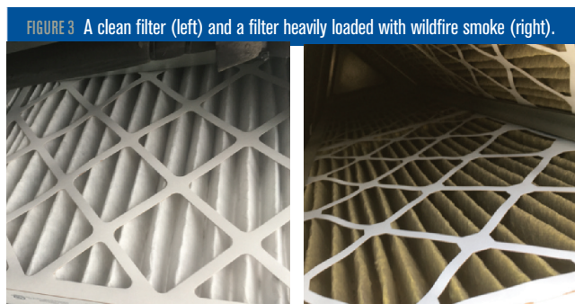
FIGURE 3 A clean filter (left) and a filter heavily loaded with wildfire smoke (right).

4. Optimize System Airflows. Assess and maintain adequate airflows that are protective of human health and equipment health during smoke events. Prior to wildfire season, determine an outdoor air intake level