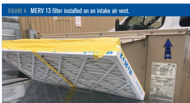
FIGURE 4 MERV 13 filter installed on an intake air vent.

that controls odor, temperature, indoor contaminant levels and maintains a positive building pressure consistent with the building and HVAC system design.