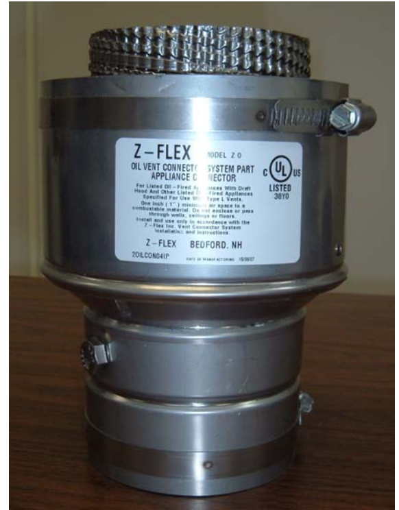
Figure 2. Z-Flex Appliance Adaptor (shipped with furnace)