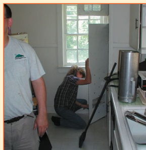
Grilles were added to the top and bottom of this water heater closet to open the confined space to the main body of the house and provide adequate combustion air for the water heater.