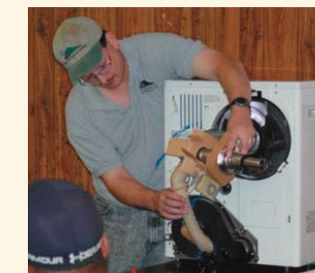
Direct-vent space heaters like this model manufactured by Monitor are good replacements for unvented space heaters.

Unvented space heaters are not allowed in mobile homes. Unvented space heaters found in mobile homes shall be replaced with direct-vent models. Pollutants and moisture in exhaust combustion gases are released by unvented space heaters into conditioned space. Moisture in the combustion gases condenses on cold surfaces, sacrificing the mobile home's durability.