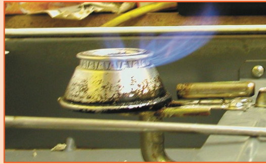
Dirt or rust prevents an even flame on this cook stove burner and causes CO to be produced. The gas openings were cleaned with a pipe cleaner to eliminate CO and allow an even, clean-burning flame.