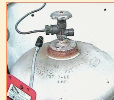
Use a gas leak detector to locate any fuel leaks.

Use a calibrated gas leak detector at joints, fittings, and along pipes to determine if fuel is leaking. Natural gas is lighter than air so test above joints, fittings, and pipes. Propane or LPG is heavier than air so test below the connections. Use soap bubbles to confirm a leak since some types of pipe dope (joint sealant) may set off the detector.