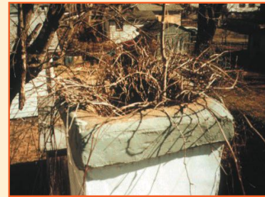
Look for the obvious! A blocked chimney cannot vent combustion gases out of the house.

Vents and vent connectors should be at least the same diameter as the exhaust port of the combustion appliance. Size the vent and vent connector using NFPA 54 or NFPA 31 based on the number and type of appliances, vent type, vent height, connector rise or lateral run, and the type of chimney.