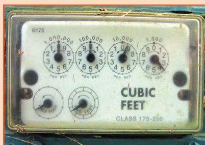
Most gas meters have 5 or 6 dials. Clock the dial that spins the fastest, which is the one labeled 1/2 or 1 cubic foot.

Clock the gas meter using the “Carl’s Calibration” card provided during training to detect under-firing or over-firing. Clock only one appliance at a time. If the actual fuel input varies from the rated input on the furnace nameplate by more than ± 10% (± 5% for 90+ condensing units), refer the unit to a HVAC technician for inspection and repair to adjust gas pressure to acceptable levels (3.5 inches of water column for natural gas and 11 inches of water column for propane).