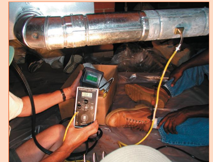
To measure CO in this floor furnace, the probe (not shown) is placed in each of the combustion ports. The draft probe is inserted in the vent as shown.