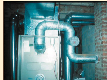
Horizontal vent runs must rise at least 1/4 inch per foot of run. The vent on this oil-fired furnace violates code and will never draft properly.