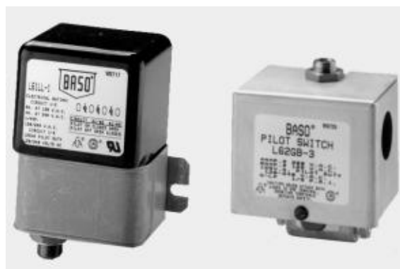
Figure 1: L61 and L62 Safety Shutoff Devices

In Non-100% shutoff models L61LL and L62AA applications, if the pilot flame is extinguished, the switch will interrupt gas flow to the main burner only , shutting down the appliance. Pilot gas will continue to flow until the pilot gas is manually shut off.