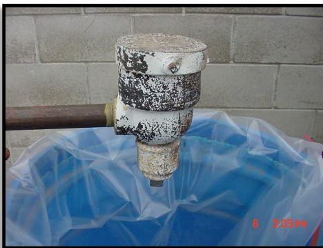
World War II-era mercury-containing gas pressure regulator.