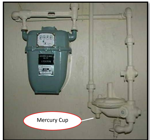
A gas pressure regulator, adjacent to a gas meter, with the location of the mercury cup identified.

REMINDER: Call 811 before you dig to identify the location of gas lines!