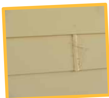
Hardi plank wall sheeting