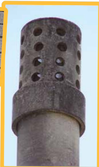
Vent pipe cap and socket fitted over a vent pipe