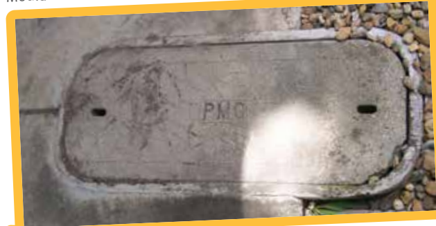
Moulded telecommunications pit