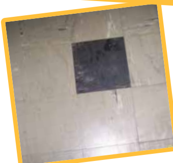
Vinyl floor tiles