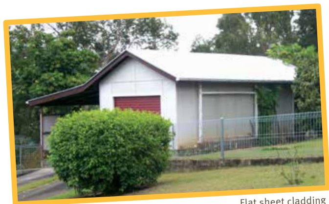
Flat sheet cladding