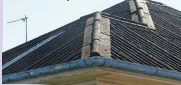
Super six roofing ridge capping and guttering

If you are taking the asbestos waste to a council approved site yourself, place the double wrapped/bagged asbestos