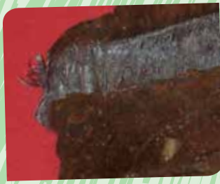
Crocidolite asbestos (blue)