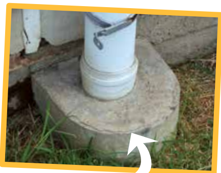
DT surround (disconnecter trap)