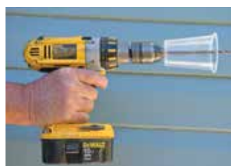
Disposable cup with hole through bottom