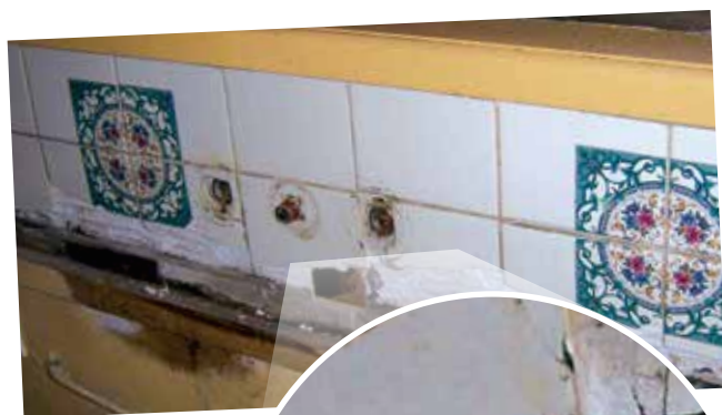
Ceramic tiles on asbestos sheeting

The sheet in question can be removed by a professional or remove it yourself using safe work procedure 4: Removing non-friable asbestos cement sheets on page 19.