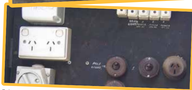
Zelemite backing board to an external switchboard