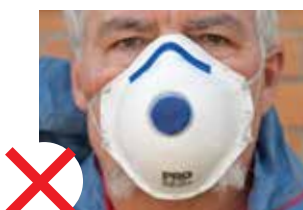
Men should be clean-shaven to ensure a good seal between their face and the mask.