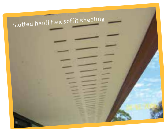
Slotted hardi flex soffit sheeting