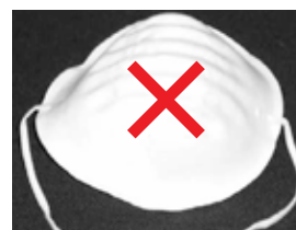
This type of dust mask with one strap DOES NOT prevent the inhalation of asbestos fibres.