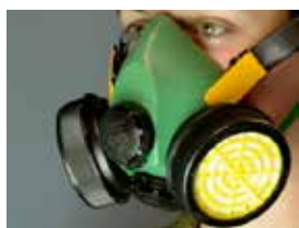
Example of a respirator for use when working with asbestos.

You will need to purchase and use a respirator designed specifically for working with asbestos. Wear a half-face filter respirator fitted with a class P1 or P2 filter cartridge, or a class P1 or P2 disposable respirator appropriate for asbestos.