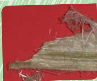
Chrysotile asbestos (white).

Asbestos is a naturally occurring mineral found in the ground. It contains strong fibres that have excellent durability, fire resistance and insulating properties.