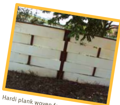
Hardi plank woven fencing