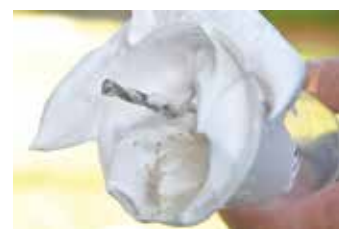
Residue dust captured in shaving cream inside cup