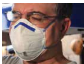
Example of a disposable P2 respirator with two straps, suitable for working with asbestos.

Respirators should comply with Australian Standard AS1716. This number should be printed somewhere on the mask.