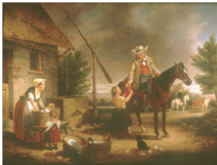
An early wooden gutter with brackets is illustrated in Francis William Edmonds' painting, The Thirsty Drover , 1856. Rain barrels or cisterns were common repositories for rain water and were ubiquitous elements in the colonial landscape. (Image courtesy of the Nelson-Atkins Museum of Art, Kansas City, Missouri. Purchase: Nelson Trust). [click image for larger view]

were made to wooden gutters over time and they became not only practical drainage components but aesthetically pleasing architectural details with classical profiles. They remained popular in the New England area until World War II. Wooden downspouts however were found to leak and were eventually replaced by metal ones.