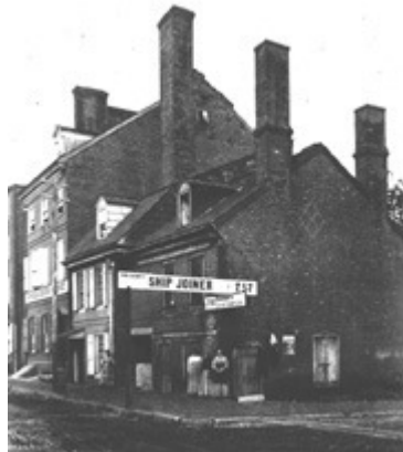
The pole gutters on the roof at 757 Swanson Street, Philadelphia in 1868 divert rainwater to a short cylindrical downspout. Moisture damage is evident on the wall of the building below the end of the pipe where there is no downspout extension. [click image for larger view]

Built-in gutters were introduced into the American vocabulary with high-style 18th century buildings. Characterized by its integration with a cornice (either open or closed), built-in gutters preserved the architectural detail of the cornice while providing a practical solution to storm water drainage. Historically these were boxes made of wood, the bottom of which was sloped, and, where possible, lined with metal, usually lead. As buildings grew in height and complexity in the 19th century, cast iron or tile internal downspouts or leaders were introduced to invisibly move water away from the roof and into subterranean drainage systems.