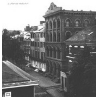
An 1871 photograph of the corner of 3rd Street, south of Walnut in Philadelphia shows a number of rain water conductor systems. In the lower left corner is a metal roof with a built-in gutter lined with metal; on the far right is a building with a wood shingle roof and a built-in gutter with exposed downspout; and in the center is a four story brick building with built-in gutters and internal downspouts. [click image for larger view]

Lead was another material used during colonial times for making gutters and downspouts. The half-round was the earliest form of hanging metal gutter and was made from sheets of hammered lead formed around wooden poles into a U-shape shaped trough. When hung, the gutter was loosely suspended from the roof eaves by straps. Early metal downspouts were typically cylindrical in shape and made of lead. Some downspouts ran only partially down the sides of buildings while others dropped to just above grade and onto splash stones, into cisterns, or into underground drainage systems. With the advent of the Revolutionary War, the military need for lead for the Colonies encouraged the use of other metals like copper, tinplate, and terneplate.