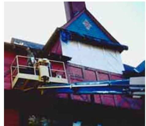
A heat plate was used on the cornice to remove paint.

Electric heat plate: The electric heat plate operates between 500 and 800 degrees Fahrenheit (not hot enough to vaporize lead paint), using about 15 amps of power. The plate is held close to the painted exterior surface until the layers of paint begin to soften and blister, then moved to an adjacent location on the wood while the softened paint is scraped off with a putty knife (it should be noted that the heat plate is most successful when the paint is very thick!). With practice, the operator can successfully move the heat plate evenly across a flat surface such as wooden siding or a window sill or door in a continuous motion, thus lessening the risk of scorching the wood in an attempt to reheat the edge of the paint sufficiently for effective removal. Since the electric heat plate's coil is "red hot," extreme caution should be taken to avoid igniting clothing or burning the skin. If an extension cord is used, it should be a heavy-duty cord (with 3-prong grounded plugs). A heat plate could overload a circuit or, even worse, cause an electrical fire; therefore, it is recommended that this implement be used with a single circuit and that a fire extinguisher always be kept close at hand.