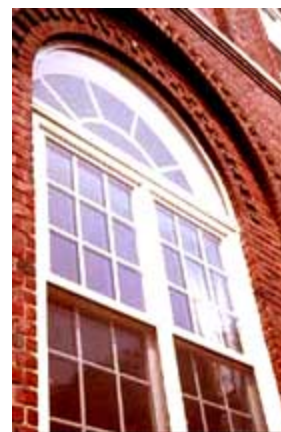
When the paint on the wood windows became too thick, it was removed and the window repainted.

If the decision to repaint is nonetheless made, the "new" color or colors should, at a minimum, be appropriate to the style and setting of the building. On the other hand, where the intent is to restore or accurately reproduce the colors originally used or those from a significant period in the building's evolution, they should be based on the results of a paint analysis.