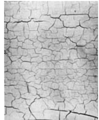
Crazing—or surface cracking—is an exterior surface condition which can be successfully treated by sanding and painting. Photo: Courtesy, National Decorating Products Association.

Discoloration due to color extractives in replacement wood can usually be cleaned with a solution of equal parts denatured alcohol and water. After the affected area has been rinsed and permitted to dry, a "stainblocking primer" especially developed for preventing this type of stain should be applied (two primer coats are recommended for severe cases of bleeding prior to the finish coat). Each primer coat should be allowed to dry at least 48 hours.