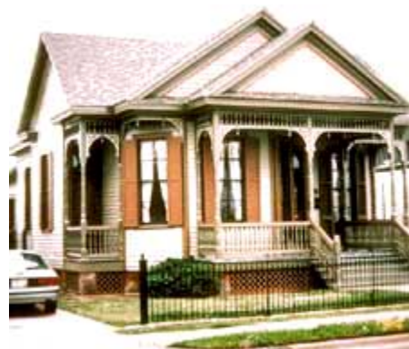
Decorative features were painted with a traditional oil-based paint as a part of the rehabilitation.

Based on the assumption that the exterior wood has been painted with oil paint many times in the past and the existing top coat is therefore also an oil paint, it is recommended that for CLASS I and CLASS II paint surface conditions, a top coat of high quality oil paint be applied when repainting. The reason for recommending oil rather than latex paints is that a coat of latex paint applied directly over old oil paint is more apt to fail. The considerations are twofold. First, because oil paints continue to harden with age, the old surface is sensitive to the added stress of shrinkage which occurs as a new coat of paint dries. Oil paints shrink less upon drying than latex paints and thus do not have as great a tendency to pull the old paint loose. Second, when exterior oil paints age, the binder releases pigment particles, causing a chalky surface. Although for best results, the chalk (or dirt, etc.) should always be cleaned off prior to repainting, a coat of new oil paint is more able to penetrate a chalky residue and adhere than is latex paint. Therefore, unless it is possible to thoroughly clean a heavily chalked surface, oil paints—on balance—give better adhesion.