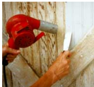
The nozzle on the electric heat gun permits hot air to be aimed into cavities on solid decorative surfaces, such as this carriage house door. After the paint has been sufficiently softened, it can be carefully removed with a scraper.

Although the heat gun is heavier and more tiring to use than the heat plate, it is particularly effective for removing paint from detail work because the nozzle can be directed at curved and intricate surfaces. Its use is thus more limited than the heat plate, and most successfully used in conjunction with the heat plate. For example, it takes about two to three hours to strip a paneled door with a heat gun, but if used in combination with a heat plate for the large, flat area, the time can usually be cut in half. Although a heat gun seldom scorches wood, it can cause fires (like the blow torch) if aimed at the dusty cavity between the exterior sheathing and siding and interior lath and plaster. A fire may smolder for hours before flames break through to the surface. Therefore, this thermal device is best suited for use on solid decorative elements, such as molding, balusters, fretwork, or "gingerbread."