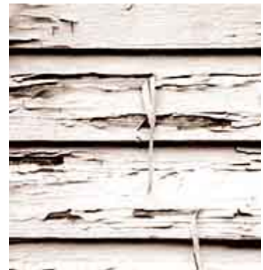
Extensively deteriorated paint needs to be removed to bare wood, then primed and re-painted.

If surface conditions are such that the majority of paint will have to be removed prior to repainting, it is suggested that a small sample of intact paint be left in an inconspicuous area either by covering the area with a metal plate, or by marking the area and identifying it in some way. (When repainting does take place, the sample should not be painted over). This will enable future investigators to have a record of the building's paint history.