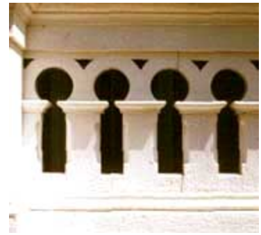
The paint on this exterior decorative feature is sound.