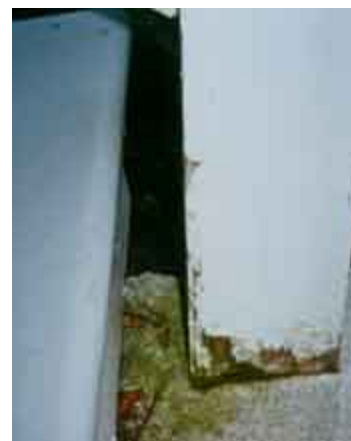
The problem evidenced here by mossy growth and deteriorated wood must be resolved and the wood allowed to dry out before the wood is repainted.

The historic building will undoubtedly exhibit a variety of exterior paint surface conditions. For example, paint on the wooden siding and doors may be adhering firmly; paint on the eaves peeling; and paint on the porch balusters and window sills cracking and alligatoring. The accurate identification of each paint problem is therefore the first step in planning an appropriate overall solution.