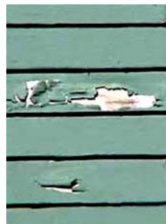
Peeling paint on historic wood siding.

Although the Brief focuses on responsible methods of "paint removal," several paint surface conditions will be described which do not require any paint removal, and still others which can be successfully handled by limited paint removal. In all cases, the information is intended to address the concerns related to exterior wood. It will also be generally assumed that, because houses built before 1950 involve one or more layers of lead-based paint, the majority of conditions warranting paint removal will mean dealing with this toxic substance along with the dangers of the paint removal tools and chemical strippers themselves.