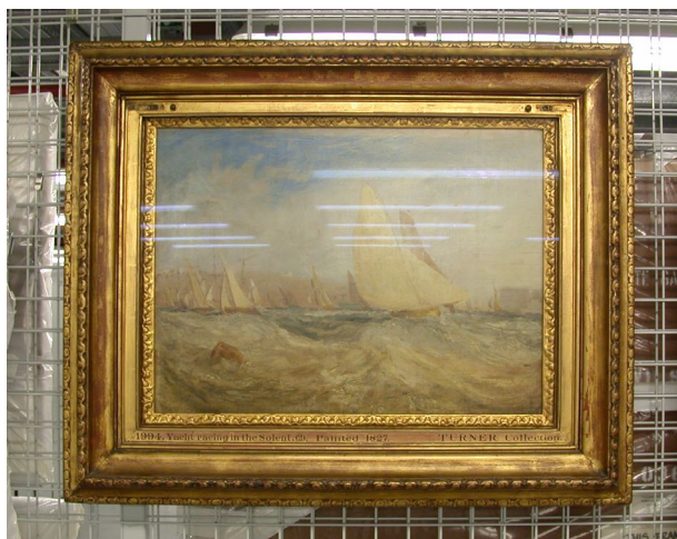
Figure 1. A nineteenth century gallery frame on a J.M.W. Turner painting ( Sketch for East Cowes Castle, the Regatta Beating to Windward, no2, 1827, Tate N01994 ). The inset door allows glazing to be removed.

A further recommendation by Faraday and Russell had been the application of backings. Because paintings were tilted for better viewing their backs were exposed to considerable dust deposition. In the 1853 report, Segurier suggested that tightly woven stretched textile be applied to the backs of frames as a dust seal. A trustee, Colonel Thwaites, expressed a concern that air should not be excluded from the canvases for fear of creating a hazard, presumably mould growth.