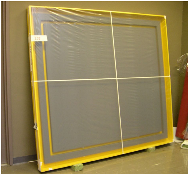
Figure 4. An unvarnished painting with a vulnerable surface protected when off display, during handling, storage and transit, by an L-section frame wrapped in polythene. The reverse is protected by a backboard either attached to the storage/transit frame or to the painting stretcher.

used for storage, with the wrapping left in place. A backboard is attached to the stretcher or the transit frame to provide physical protection for the rear. The space between the painting and the backboard is a microenvironment. Its stability depends on the paint film. An acrylic film is a poor moisture barrier, whereas a varnished oil film is very much better. A varnished traditional oil painting in a heavy frame can provide almost as much RH stability as if it were glazed.