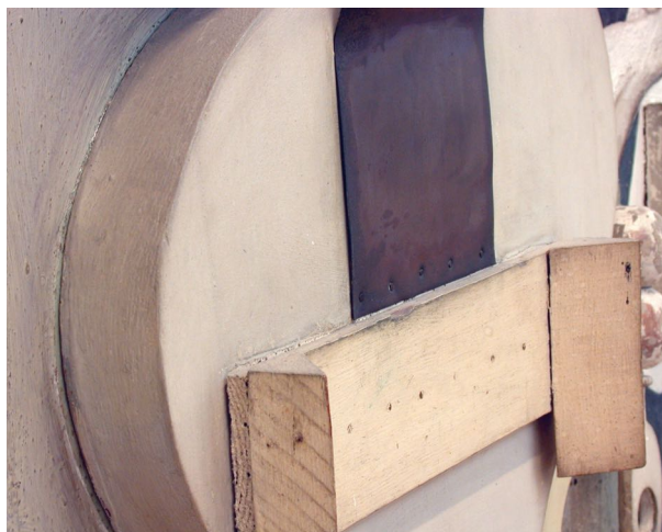
Figure 2. An unvarnished oil painted relief by Ceri Richards ( Two Females, 1937-8, Tate T00307 ) which cannot be protected on display and has accumulated considerable dirt particularly on the top of horizontal surfaces. © The estate of Ceri Richards

The following period saw fundamental changes in art that would lead many artists to reject framing. At its height the concept of 'finish' was essential to any painting exhibited by serious artists, such as academicians. Finish involved a high level of obvious workmanship and detail, and even included an overall shiny varnish. Whistler was accused by Ruskin of having fallen below this standard, yet Whistler took great care to design individual frames and to consider the presentation of his work in context. His contemporaries in France at the Salon des Refusés challenged the establishment more