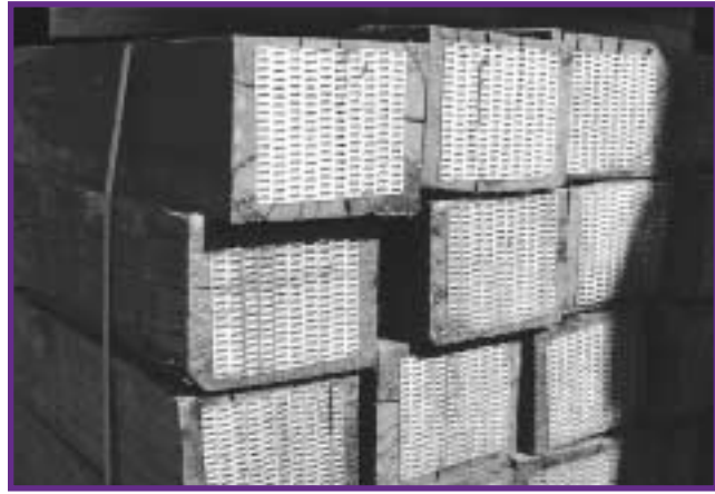
Creosote-treated wood products have been instrumental in the development of the U.S. railroad industry.

The high price of oil made the creosote process expensive, so an empty-cell process was developed by Max Rüping of Germany, and patented in 1902. This process utilizes an initial application of air pressure (usually 30 to 50 psig) before filling the cylinder and applying a higher pressure (usually 100 psig above the initial air pressure) to inject the preservative. After release of pressure, the excess preservative in the cell lumen is “kicked back,” resulting in a much lower retention than the conventional full-cell treatment. An extended steam flash and vacuum period applied after removal of preservative solution completes the process. This step reduces the amount of entrapped air and hence bleeding of preservative, yielding a much cleaner treatment. A second empty-cell treatment patented by C.B. Lowry