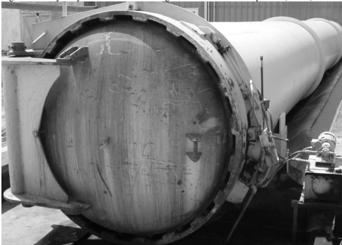
Figure 1. Heavy Duty Wood Preservative High Pressure Treatment Cylinder (Retort)

Again, due to the unique nature in which heavy duty wood preservatives are applied, wood preservative risk assessment requires a different approach than those used for standard agricultural or antimicrobial pesticides. For example, unlike agricultural pesticide handlers who may be exposed to pesticides when mixing/loading, applying, or re-entering an area treated with a pesticide, treatment facility workers may be exposed to pesticides when handling treated wood and/or performing activities related to operating the treatment cylinder.