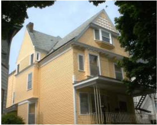
112 Plymouth Avenue