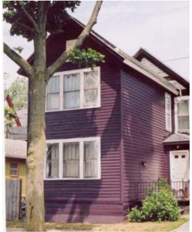
51 Plymouth Avenue