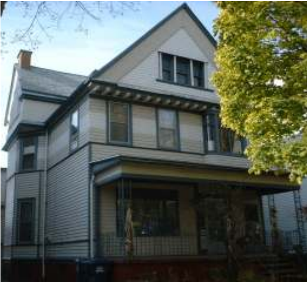
88 Plymouth Avenue

Address: 88 Plymouth Ave. Style: Queen Anne Construction: Frame Exterior: Wooden clapboards Year Built: 1887 Original Owner: W. F. Duckwitz References: Permit: PCC 1887 P 864. W. F. Duckwitz, erect frame dwelling 31 x 60 feet two stories high on west side Plymouth Ave., 155 feet north of Pennsylvania Street Erie County Deed: L526 P423. Wm. G. Fargo estate to Duckwitz, 10/24/1887 $3,600. Permit: 6/26/1911 34038 Henry Guggenheim, enlarge 2 story frame dwelling