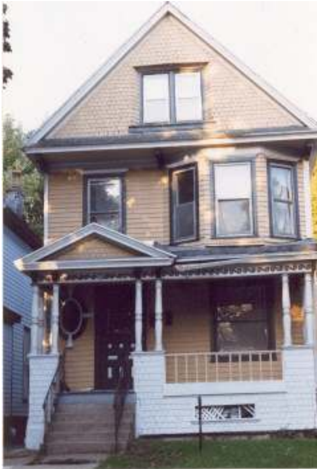
49 Plymouth Avenue