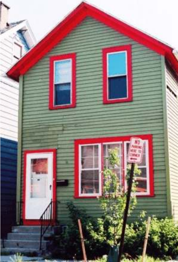
55 Plymouth Avenue

Address: 55 Plymouth Ave. Style: Gabled Italianate Construction: Frame Exterior: Composition siding over wooden clapboards Built: Circa 1875 References: Permit: PCC 1872 P736. Eva Catharine Wickser, to erect frame barn on lot, corner Pennsylvania and Twelfth Street; also to remove frame building on lot corner PA and Twelfth Street to line of said lot. Permit: PCC 1885 P130. Eva C. Wickser to move building 16 1/4 feet by 46 feet, from south side of Pennsylvania Street 32 feet east of Plymouth Avenue to the east side of Plymouth Avenue, 68 feet south of Pennsylvania Street and move barn, 18 by 24 feet to rear of same lot. Also, P379, move building from 323 Pennsylvania Street to east side of Plymouth Ave. 68 feet south of Pennsylvania Street and make frame addition to barn. Permit: 8/16/1968, Salvatore Masucci, demolish to grade one story frame private garage by owner only. Permit: 2/17/1977 Salvatore Masucci, repair 1½ story frame one family dwelling, re-roof, replace plastered walls with plaster board, repair cellar walls and general interior and exterior repairs.