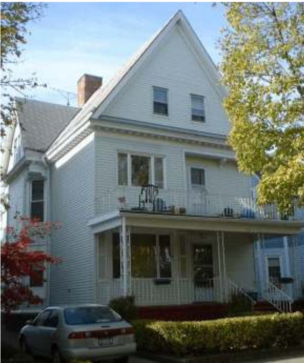
92 Plymouth Avenue

Address: 88 Plymouth Ave. Style: Queen Anne Construction: Frame Exterior: Wooden clapboards Year Built: 1887 Original Owner: W. F. Duckwitz References: Permit: PCC 1887 P 864. W. F. Duckwitz, erect frame dwelling 31 x 60 feet two stories high on west side Plymouth Ave., 155 feet north of Pennsylvania Street Erie County Deed: L526 P423. Wm. G. Fargo estate to Duckwitz, 10/24/1887 $3,600. Permit: 6/26/1911 34038 Henry Guggenheim, enlarge 2 story frame dwelling