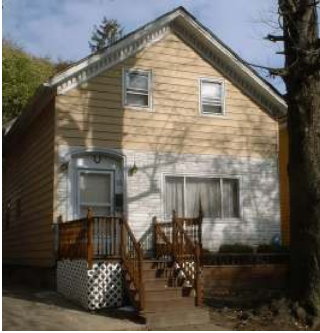
33 Plymouth Avenue