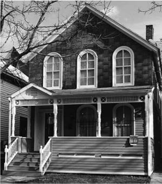
39 Plymouth Avenue

Address: 39 Plymouth Ave. Style: Gabled Italianate Construction: Frame Exterior: Asphalt siding covering wooden clapboards Built: 1872 Notes: 1880 resident: Wm. A. Walsh, a dry goods clerk with Flint & Kent References: Permit: 10/1872 PCC 1872 P736 Oct. 1872 Wm. Ascough to erect 1½ story building, 20 x 30 w/ kitchen 14 x 18, on lot on the east side of Twelfth Street 220' S of Pennsylvania Street. Permit: PCC 1947 P1171, F. W. Wentzel, convert to three family dwelling, one on 1 st floor, two on 2 nd floor.