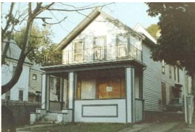
43 Plymouth Avenue

Address: 39 Plymouth Ave. Style: Gabled Italianate Construction: Frame Exterior: Asphalt siding covering wooden clapboards Built: 1872 Notes: 1880 resident: Wm. A. Walsh, a dry goods clerk with Flint & Kent References: Permit: 10/1872 PCC 1872 P736 Oct. 1872 Wm. Ascough to erect 1½ story building, 20 x 30 w/ kitchen 14 x 18, on lot on the east side of Twelfth Street 220' S of Pennsylvania Street. Permit: PCC 1947 P1171, F. W. Wentzel, convert to three family dwelling, one on 1 st floor, two on 2 nd floor.