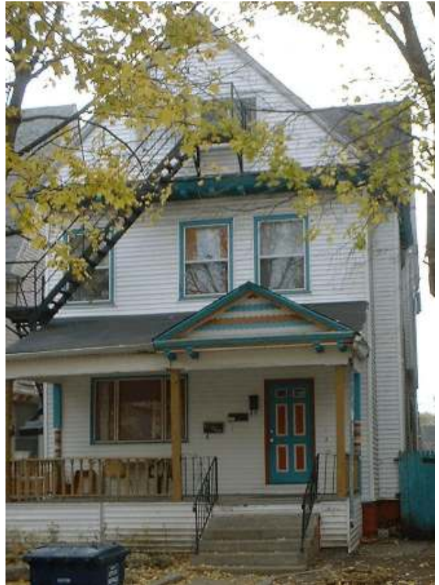
116 Plymouth Avenue

Permit: 8/4/1921, Henry Zink, convert 3 story frame tenement.