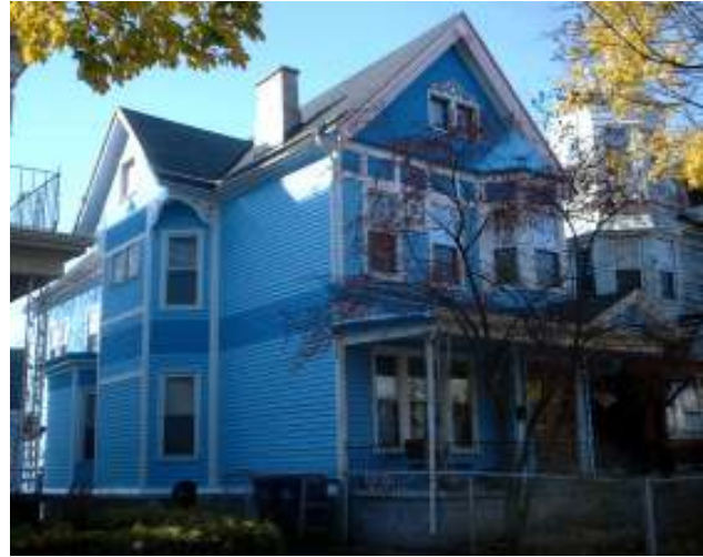
94 Plymouth Avenue