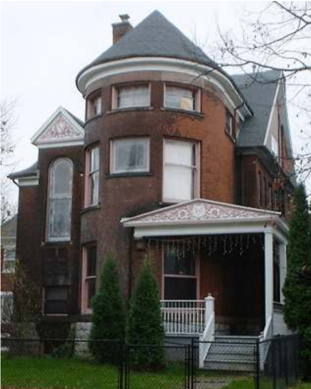
305 Jersey Street