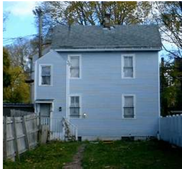
47 Plymouth Avenue, Rear

Address: 47 Plymouth Ave. Rear Style: Cottage Construction: Frame Exterior: Wooden clapboards covered with vinyl siding Built: Unknown, moved in 1903 References: Permit: PCC 1903 P761 Frank Newfield, to move frame part of house, 14 x 24 x 20' high to rear of lot and build frame woodshed, 12 x 14 x 14' high, one family, front of lot, no. 47 Plymouth Avenue. Permit: 4/30/1906 and 8/8/1906, F. Newfield, cellar wall Permit: PCC 1915 Frank Newfield, to enlarge frame dwelling, 14' x 27' x 10' to be 28' x 28' x 10' rear of lot, 45-47 Plymouth Ave.