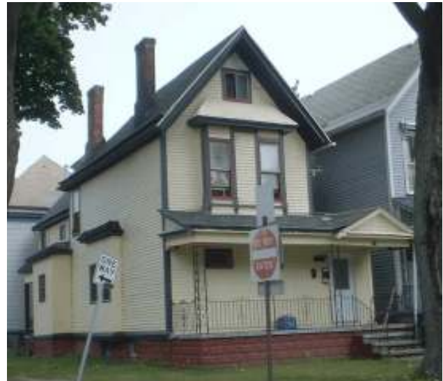
322 Pennsylvania Street

Address: 322 Pennsylvania St. Style: Queen Anne Construction: Frame Exterior: Wooden clapboards Cost: $5,000 Year Built: 1882