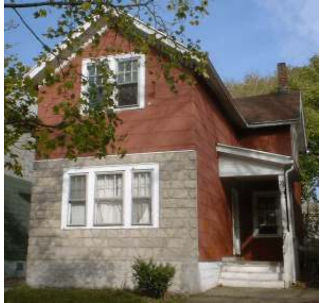
35 Plymouth Avenue