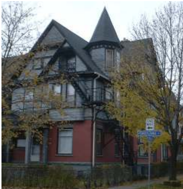
312 Pennsylvania Street

Permit: 5897, 9/20/1895, 84 [82] Plymouth Avenue, 2 story frame dwelling. CCP 1895 P1625, John C. Heinold to erect frame dwelling, 25 x 60 x 20' high and barn, 26 x 30 x 16' high, no. 84 Plymouth Avenue.