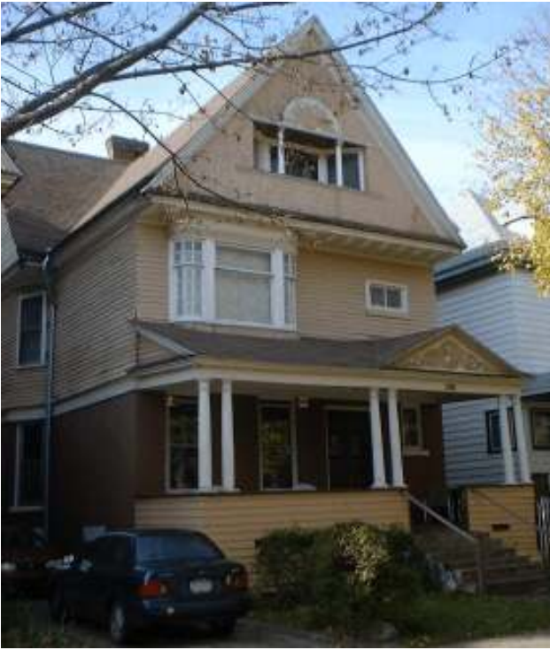
104 Plymouth Avenue