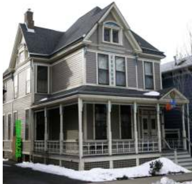
325 Pennsylvania Street