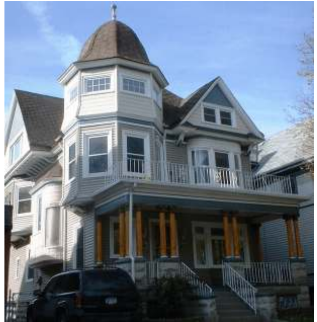
82 Plymouth Avenue