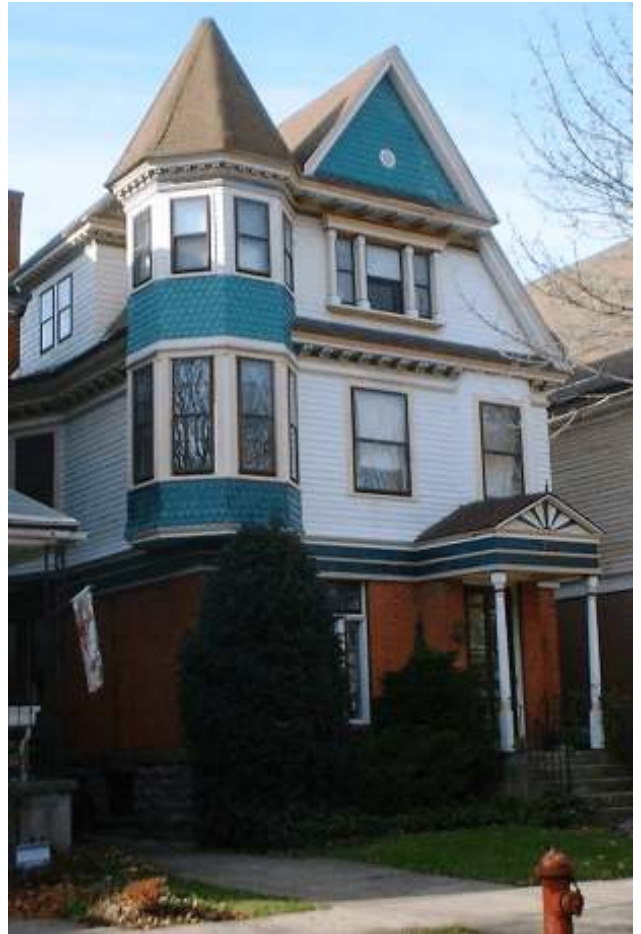
100 Plymouth Avenue