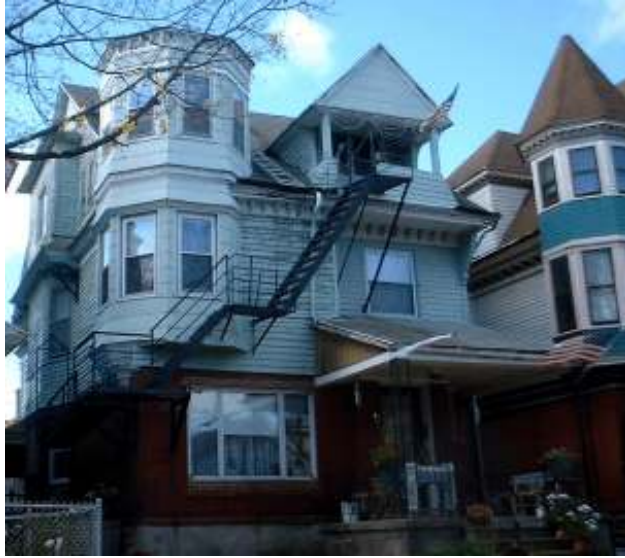
96 Plymouth Avenue

10/24/1887; est. of Wm. F. Fargo to F. Knoll. Erie County Deed: L625 P456, 3/16/1891. Architect Reference: Architectural Era . Volume 2. June, 1888. Page 109.