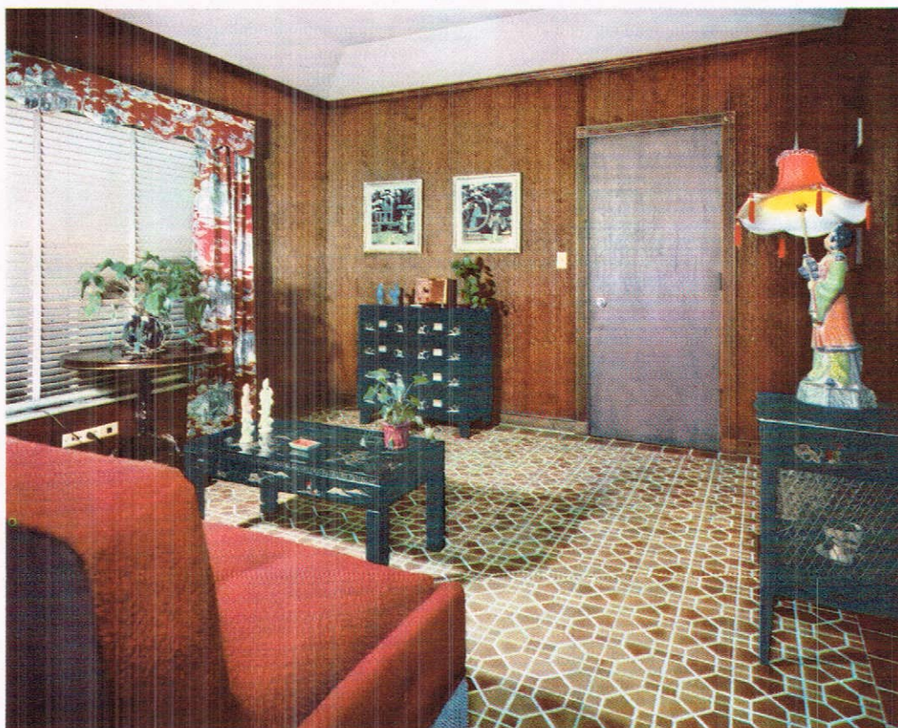
Mosaic's Cherokee quarry tile makes an effective floor in this attractive Florida residence.

In Mosaic tile, with its many types and sizes, you have an exciting choice of colors. Mosaic wall and floor tile colors are newly styled for modern color selection.