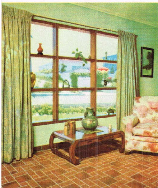
The choice of Mosaic's quarry tile for the living room floor of this California home, was made for its beauty and rugged utility.