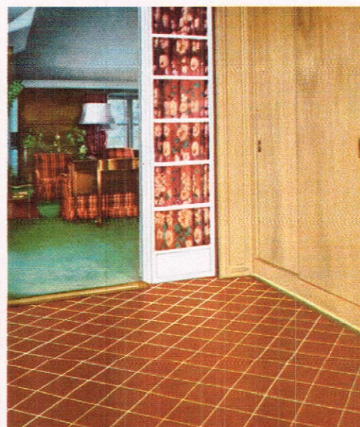
Mosaic's quarry tile leads the way into this modern home with its functional sliding door cabinets and comfortable interior.