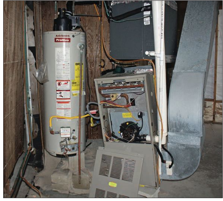
Figure 1: A water heater and furnace system damaged by Hurricane Sandy floodwaters (Beach Haven, NJ)

Many of the houses observed to have severely damaged utility systems may not have received Substantial Damage. This Recovery Advisory addresses houses that were not Substantially Damaged during Hurricane Sandy and are not undergoing Substantial Improvement. Repair and restoration work on these houses must be done in a manner that will not violate any floodplain management requirement in effect when originally built. Homeowners should always check with local building departments, as locally