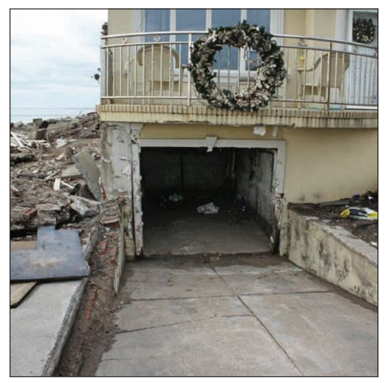
Figure 2: Coastal house with a below-grade garage and storage area, which typically contain utility systems. These areas are subject to flooding (Manhattan Beach, Brooklyn, NY).

If there is insufficient space on a higher floor, a homeowner may choose to build an elevated addition to the house to be used as a utility room. Moving equipment to a higher floor is particularly important for houses where the equipment is currently in basements and below-grade garages (Figure 2).