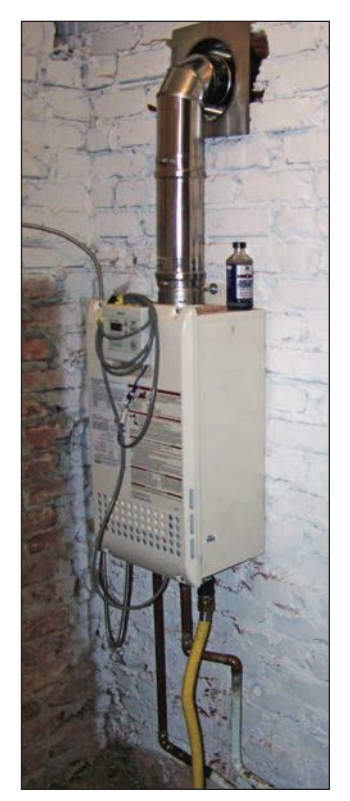
Figure 4: Tankless water heater (Atlanta, GA)

Other water heaters. A homeowner may consider using a tankless water heater, which has little storage capacity and heats water instantaneously (see Figure 4). Although more expensive than conventional water heater systems, tankless systems require significantly less space and may present a flood mitigation opportunity due to their smaller size. Converting a conventional water heater unit fueled by natural gas to a tankless system requires minimal additional work. Electric tankless water heaters, by comparison, may not be practical because of the electrical system upgrades needed in some houses to provide the additional electrical power for the water heater.