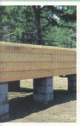
Clearance between the ground