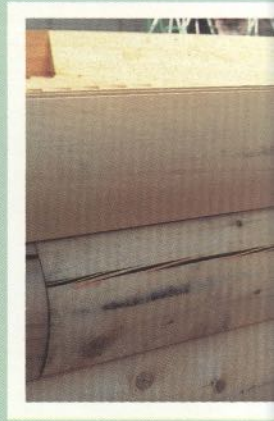
Proper construction techniques caused by checking and s...

Today, home builders are discovering that log homes can provide attractive, long-lasting shelter, but that they also can have insect, wood rot and exterior finishing problems if improperly constructed and maintained. Also, heating and cooling costs can be higher for log homes as compared to conventional homes. To be assured of satisfaction with the final product, potential log home owners should be aware of possible problems so that they can be prevented.