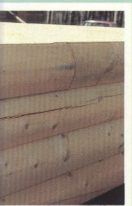
help prevent problems

Proper roof construction helps prevent wood decay in walls, foundations, doors and windows. The roof overhang should not be less than 18 inches (preferably 24 inches) for