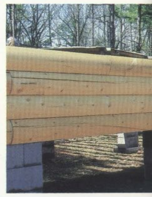
It is necessary to provide adequate ventilation and the first log.