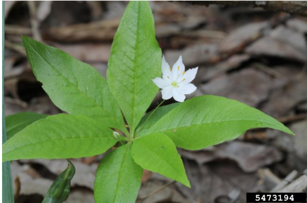
Star-flower ( Trientalis borwalis ).

normal rainfall amounts for the area are best suited for use in a drain field planting. Plants that have aggressive, woody, water-loving, deep roots can potentially clog or disrupt the pipes in the system, causing serious damage that can be very expensive, very messy and threaten the environment. The key is to select plants that will satisfy landscaping needs while posing as minimal a threat to the drain field as possible.