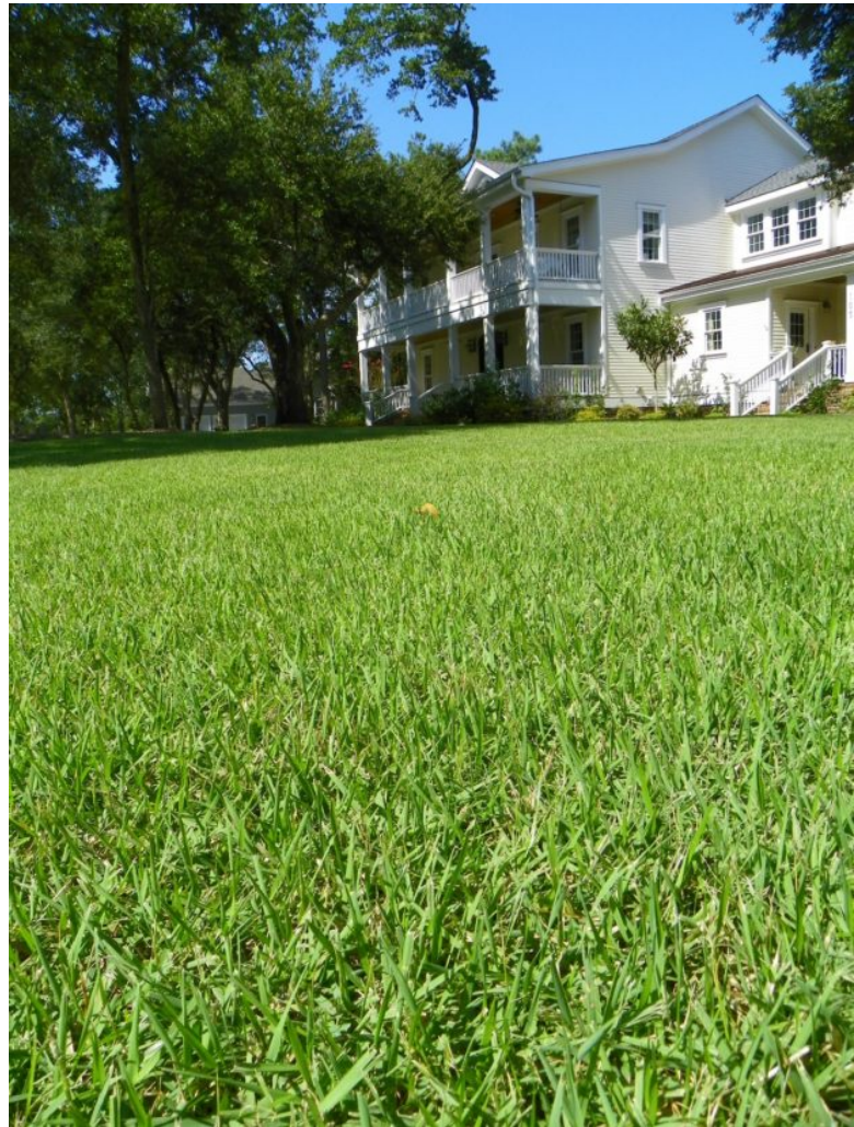
Zosia Lawn. N.C. Corporative Extension

field is not recommended because of the threat that their associated root systems pose to the long-term functionality of the drain field. No one wants septic effluent surfacing in their yard, not to mention the cost of repairs and the associated inconveniences. However, there are certainly recommendations for which plants should or should not be planted on or around the drain field.