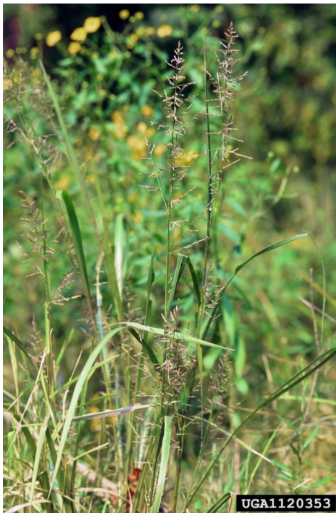
Switchgrass ( Panicum virgatum ).

best choices for use on a septic drain field. Ornamental grasses also offer the advantages of having a fibrous root system that holds soil in place, and providing year-round cover. The following listing of suggested plants is not meant to be all-inclusive, but rather a small sampling of suggested plants for use. Suggested plants should be further investigated to ensure that individual site conditions and location are conducive to that plant's cultural requirements, especially soil moisture and sunlight duration.