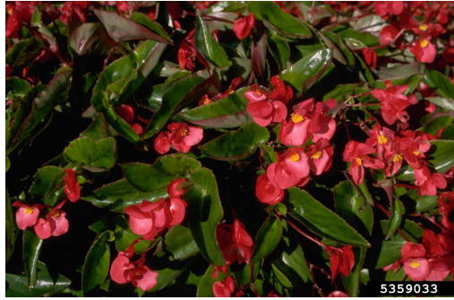
Hardy Begonia ( Begonia spp.).