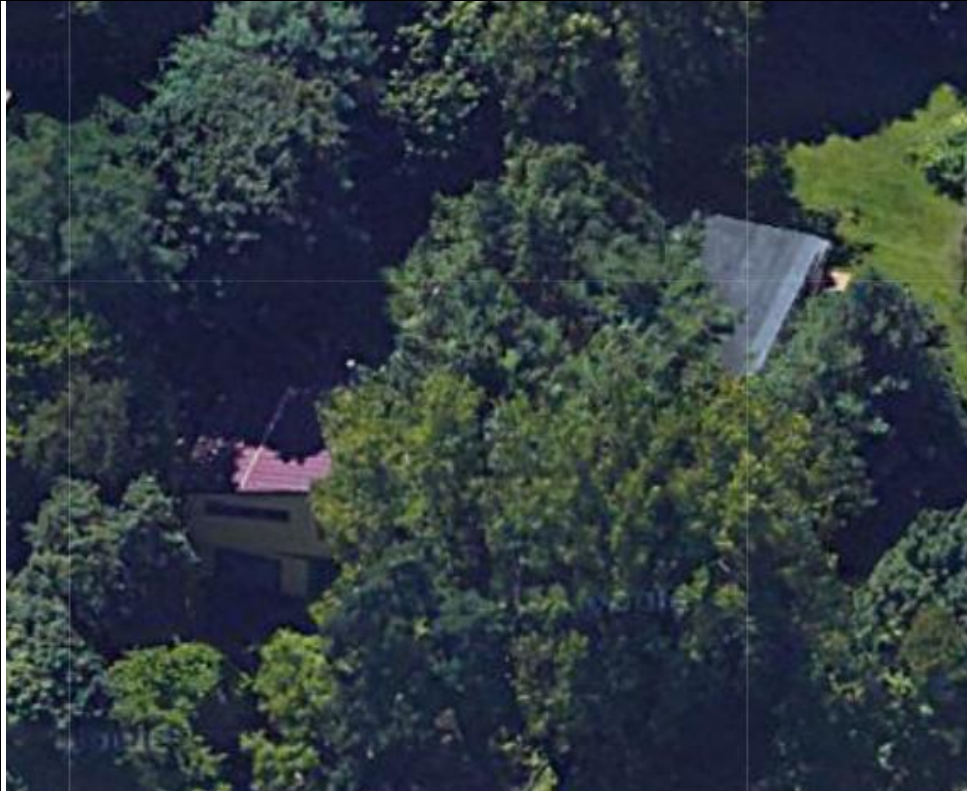
North Side View