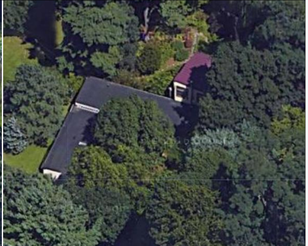
South Side View