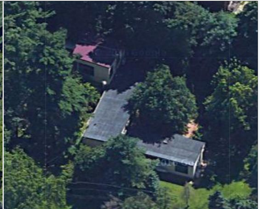
West Side View