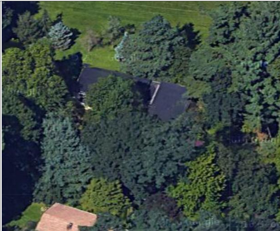
East Side View