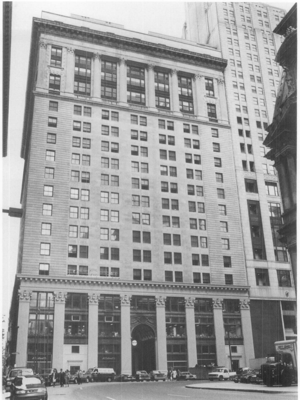
Figure 7. The South Penn Square elevation after its successful cleaning using the water soak method.

The cost of using the water soak method to clean the 100,000 square feet of limestone was approximately one-half the cost of chemical cleaning.