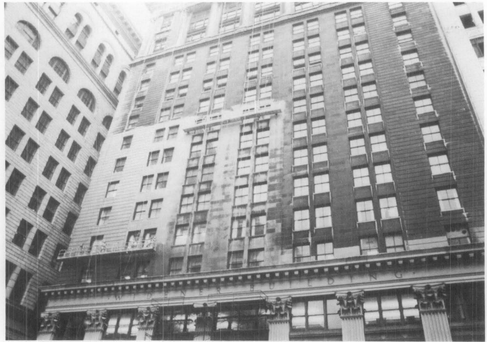
Figure 5. The drop on the left side of the building has been water-soaked and rinsed, while the drop on the right has been soaked only. Note the amount of soil that still remains on the right side before rinsing.

The other two elevations of the building were washed in the same fashion. Each elevation took a 1 or 2 person crew approximately 5 weeks to complete, the crew typically working 1½-2 shifts per day, 6 days per week.