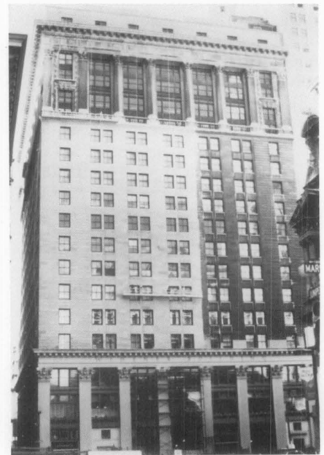
Figure 6. The contrast between the cleaned and the uncleaned portions of the facade after completion of both the water soak and the washdown rinse of these two drops from the 14th-4th floors is dramatic.

Water soaking is a cost-effective cleaning process for both large and small limestone buildings. The results of the cleaning of the Widener Building are startling, especially when compared to the appearance of the stone prior to the start of the project ( see figure 7 ). Although the cleaning team was on the job site for a longer