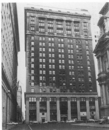
Figure 1. In 1989, just prior to the onset of the rehabilitation project, the Widener Building was showing the effects of 75 years of exposure to an urban environment. Note the lighter color of the left side of the building regularly washed by rain.

The rehabilitation of historic buildings often includes the cleaning of the masonry. Removal of the deleterious deposits of particulate matter from the stone's surface generally enhances the appearance of an historic building and in the case of calcareous stones, furthers the long-term preservation of the masonry by eliminating whatever is damaging the fabric. Since the Widener Building had been subjected