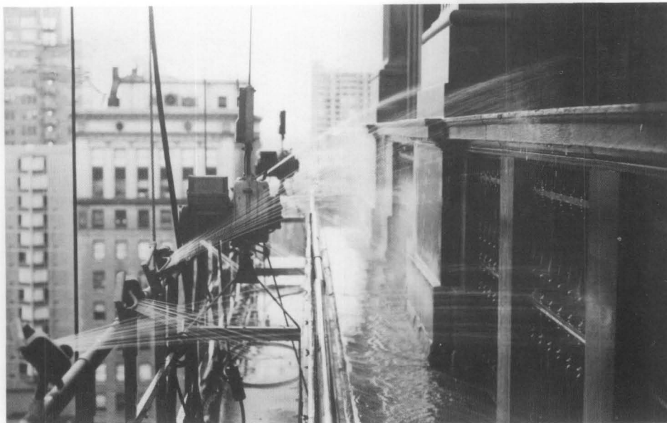
Figure 3. Close-up view of the oscillating sprinklers spaced 3 feet apart and connected to 1/4" PVC piping attached to the rear bar of each scaffold.

large amounts of water, and thus had to be completed well before there was a threat of freezing temperatures. This was to avoid the possibility of damage that might result from water freezing inside the saturated masonry, which would cause the stone to spall. In addition, the water to be used for the cleaning had to be analyzed to determine if it contained potentially harmful substances that might be introduced into the stone. Based on information obtained from the City of Philadelphia Water Department, it was determined that unfiltered city tap water could be used since it was sufficiently pure. This water has a pH of 8.2, and contains the following minor impurities, identified below in parts per million: