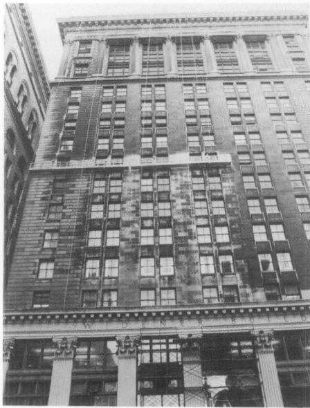
Figure 4. South Penn Square elevation after the completion of two drops from the 9th-4th floors of water soaking only, and prior to beginning the rinse process.

soaking had been completed on both drops (a "drop" is the amount of vertical wall surface that can be covered by one scaffold moving vertically up or down a building), the crew began the rinsing process this time moving down the elevation, starting from the 9th floor and proceeding to the 4th ( see figure 4 ).