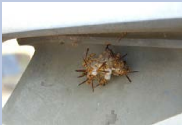
Figure D. Yellow jackets that are nesting below the projecting molding of this grave marker pose a hazard to visitors and staff because, if disturbed, they will vigorously defend their nest. Yellow jacket, paper wasp and hornet nests should be removed from grave markers by trained staff or specialists.

Snakes, wasps, and burrowing animals inhabit historic cemeteries (Fig. D). Snakes sun on warm stones and hide in holes and ledges, so it is important to be able to identify local venomous snakes. An appropriate venomous snake management plan should be in place, and