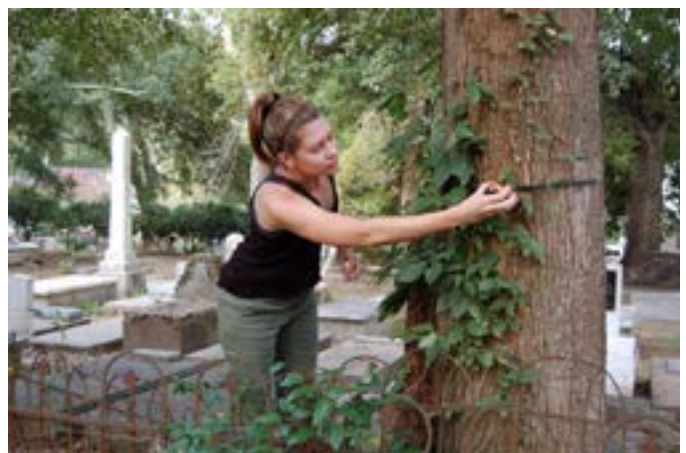
Figure 12. A cemetery professional undertakes a tree inventory in American Cemetery, Natchitoches, LA, to determine the health of trees in the cemetery. Management decisions for trimming or removal are based on the inventory.

Inappropriate maintenance activities can be devastating. One of the most common threats stems from improper lawn care, particularly the misuse of mowing equipment and string trimmers (weed whackers). The use of large mowers or mishandling them can lead to displacement of markers. Scrapes, gouges and even breakage also can occur. Improper use of string trimmers in areas immediately adjacent to grave markers can result in