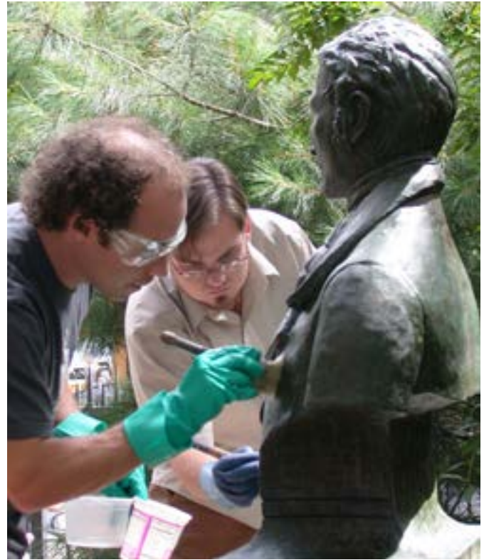
Figure 22. A protective coating must be maintained on metal elements. Wax or lacquer coatings help preserve the bronze patina and slow corrosion. Conservators apply a microcrystalline wax to this bust at St. Mark's Church in-the-Bowery, New York, NY.

Wax coatings are often used for bronze markers (Fig. 22). Wax provides a protective barrier against moisture, soiling, and graffiti. There are several steps in the wax application process. Where there is little corrosion, gentle cleaning of the marker is undertaken prior to applying the wax coating. Apply a thin layer of wax to the marker using a stencil brush or chip brush.