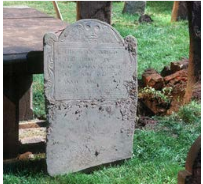
Figure 20a. This slate grave marker in the Ancient Burying Ground in Hartford, CT, is a ground-support stone. Resetting requires digging a hole that will hold the base of the stone and then compacting the soil at the bottom of the hole by hand.

Inexperienced staff or volunteers should not attempt resetting without training from a conservator, engineer, or other preservation professional. When dealing with fragile or significant grave markers, or those with large