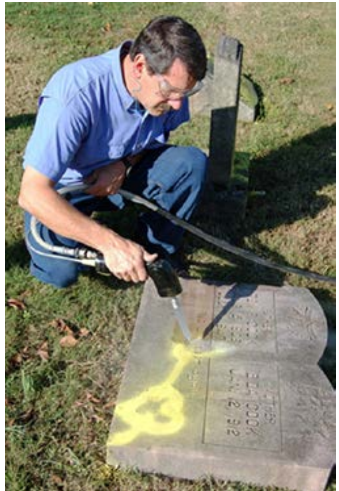
Figure 18. Graffiti is carefully removed using a low-pressure dry-ice misting instrument.

If the graffiti is water soluble, it can be removed using water and a soft cloth or towel. Rinsing the cloth frequently helps to avoid smearing graffiti on unaffected areas. If the graffiti is not water soluble, organic solvents or commercial graffiti removal products suitable for the grave marker material are recommended. Products should be tested prior to use. General cleaning of the entire marker is a good follow-up for a more even appearance. For deep-seated graffiti, poultice cleaning (previously described) may be required to extract staining materials.