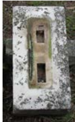
Figure 3. A multi-element grave marker from the early 19th century in the St. Michael’s Cemetery, Pensacola, FL, consists of a vertical element with tabs (left image) into a slotted base (right image).

Stacked-base grave markers use multiple bases to increase the height of the monument and provide a stable foundation for upper elements. Tall, four-sided tapered monuments, known as obelisks, are typically placed on stacked bases. Columns or upright pillars have three main parts – a base, shaft, and capital. Multiple-element grave markers may also include figurative or sculptural components. Traditionally, stacked base grave markers were set on lead shims with mortar joints or with lead ribbon along the outer edges.