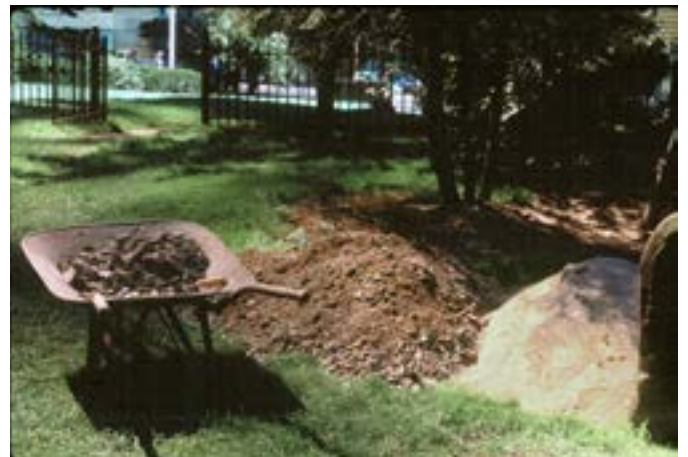
Figure 20b. To facilitate drainage, crushed stone, gravel, and sharp sand line the hole and are hand-tamped around the stone after placement.