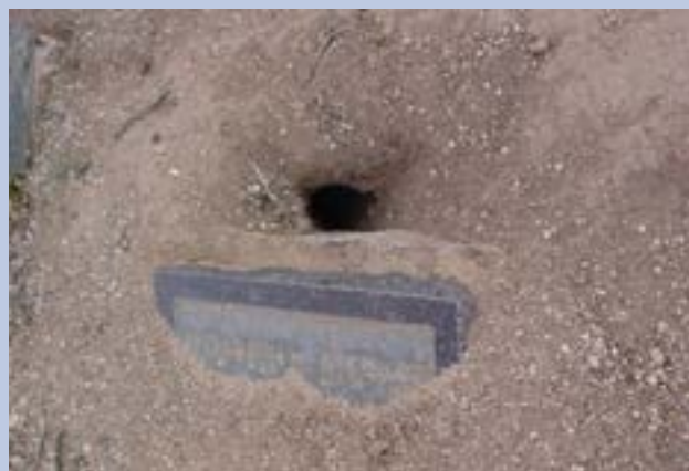
Figure C. Gophers and other burrowing animals produce uneven ground and holes that are trip and falling hazards to visitors and staff of historic cemeteries.

Trip and falling hazards include uneven ground, holes, open graves, toppled grave markers, fallen tree limbs, and other debris (Fig. C). Sitting, climbing, or standing on a grave marker should be avoided since the additional weight may cause