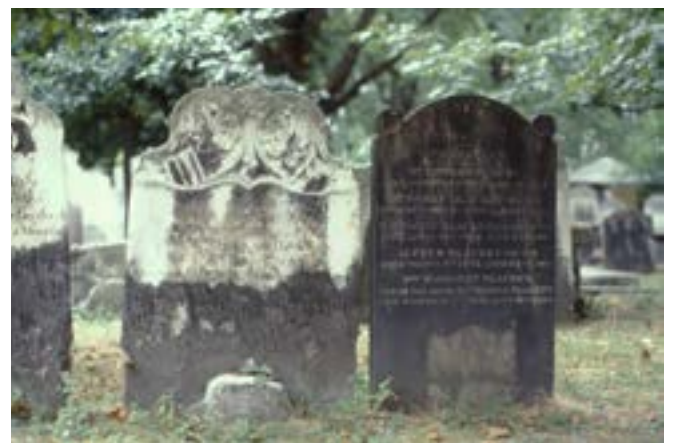
Figure 9. The limestone and sandstone grave markers in this historic cemetery have different weathering processes. On the left, the limestone shows surface loss in areas exposed to rainwater and gypsum crust formation below. The sandstone marker on the right displays uniform soiling, but surface hardening may be occurring.

All grave marker materials deteriorate when they are exposed to weathering such as sunlight, wind, rain, high and low temperatures, and atmospheric pollutants (Fig. 9). If a marker is composed of several materials, each may have a different weathering rate. Some weathering processes occur very quickly, and others gradually affect the condition of materials. Weathering results in deterioration in a variety of ways. For example, when exposed to rainwater some stones lose surface material while others form harder outer crusts that may detach from the surface.