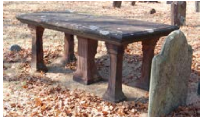
Figure 4. This sandstone table tomb, located in Cedar Grove Cemetery, New London, CT, is an engineered grave marker structure consisting of a horizontal stone tablet supported by four vertical table “legs” with and a central column,.

Grave markers can also be engineered structures. Examples of grave marker structures include masonry arches, box tombs, table tombs, grave shelters, and mausoleums (Fig. 4). The box tomb is a rectangular structure built over the gravesite. The human remains are not located in the box itself as some believe, but