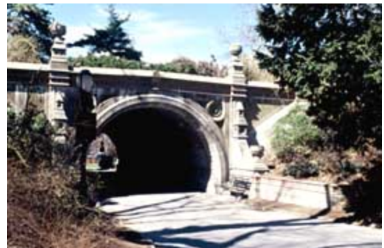
Constructed in 1868 of Beton Coignet, the Cleft Ridge Span in New York City's Prospect Park is one of the earliest extant cast stone structures in the United States.

Another product which utilized natural cement as its cementing agent was Beton Coignet (literally, "Coignet concrete," also known as "Coignet Stone"). Francois Coignet was a pioneer of concrete construction in France. He received United States patents in 1869 and 1870 for his system of pre-cast concrete construction, which consisted of portland cement, hydraulic lime, and sand. In the United States the formula was modified to a mix of sand with Rosendale Cement ( a high quality natural cement manufactured in Rosendale, Ulster County, New York). In 1870 Coignet's U.S. patent rights were sold to an American, John C. Goodrich, Jr., who formed the New York and Long Island Coignet Stone Company. This company fabricated the cast stone for one of the earliest extant cast stone structures in the United States, the Cleft Ridge Span in Prospect Park, Brooklyn, New York.