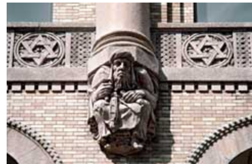
Sculptural ornament was frequently produced in cast stone. Repetitive detail, such as these banding course panels on the Level Club in New York City (1926), were produced much more economically than they could be in natural stone.