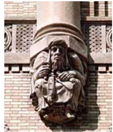
Detail of sculptural cast stone ornament on the Level Club, New York City (1926).