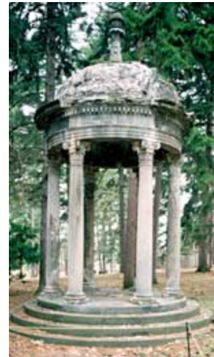
Scaling of cast stone units signals problems with the cementing mix and method of manufacture. Serious deterioration of cast stone, such as this, warrants replacement.

More common and less serious than flaking or scaling caused by deterioration of the cementing matrix is the erosion of the surface of the matrix. This usually occurs on surfaces of projecting features exposed to water runoff, such as sills, water tables, and window hoods. In these areas, the matrix may erode, leaving small grains of aggregate projecting from the surface. The resultant rough surface is not at all the intended original appearance. In some historic cast stone installations, the thin layer of cement and fine sand at the surface of the cast stone units was not originally tooled from the molded surface, but was finished with patterns of masonry pigments in a stylized imitation of highly figured sandstones or limestones. Erosion of the pigmented surface layer on this type of cast stone results in an even more dramatic change in appearance.