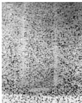
This completed composite repair could have been improved by brushing to remove the matrix residue at the edges of the repair before the surface cured.