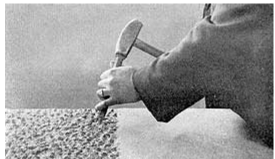
Historically, a point finish was put on with a single pointed chisel.

High quality cast stone was frequently "cut" or tooled with pneumatic chisels and hammers similar to those used to cut natural stone. In some cases, rows of small masonry blades were used to create shallow parallel grooves similar to lineal chisel marks. The results were often strikingly similar in appearance to natural stone. Machine and hand tooling was expensive, however, and simple molded cut cast stone was sometimes only slightly less costly than similar work in limestone. Significant savings could be achieved over the cost of natural stone when repetitive units of ornate carved trim were required.