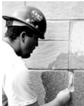
The composite mortar is applied to the void with a small spatula or trowel.