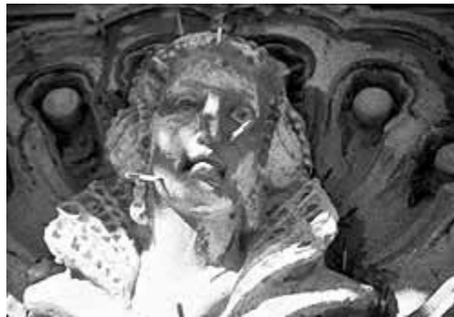
A delaminated layer of ornamental cast stone on the Orpheum Theater, San Francisco, California (1925), was successfully re-attached using epoxy. The multiple delivery ports for the epoxy are removed after treatment and the holes patched.

The weathering of cast stone, while different from that of natural stone, produces a patina of age, and does not warrant large-scale replacement, unless severe cement matrix problems or rusting reinforcement bars have caused extensive scaling or spalling. Severe rusting of reinforcement bars on small decorative features, such as balusters, may signal carbonation (loss of alkalinity) of the matrix. Where carbonation of the matrix has occurred, untreated reinforcement will continue to rust. Replacement may be an acceptable approach for exposed and severely deteriorated features, such as hand railings, roof balustrades, or wall copings, where disassembly is unlikely to damage adjacent construction. Conversely, small areas of damage should generally be repaired with mortar "composites," or left alone.