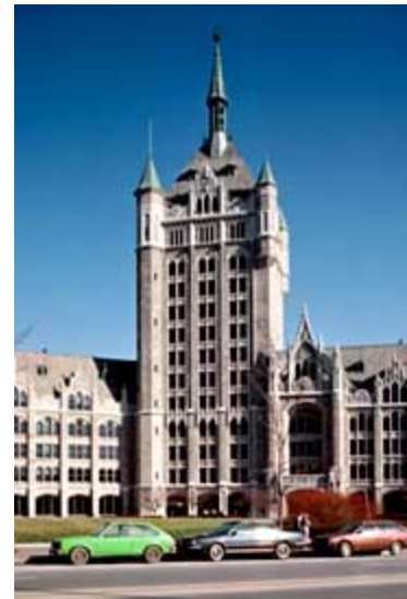
The prominent Delaware and Hudson Building, Albany, New York, (1916) made extensive use of cast stone as trim combined with a random ashlar facing of natural granite.

Having gained popularity in the United States in the 1860s, cast stone had become widely accepted as an economical substitute for natural stone by the early decades of the 20th century. Now, it is considered an important historic material in its own right with unique deterioration problems that require traditional, as well as innovative solutions. This Preservation Brief discusses in detail the maintenance and repair of historic cast stone-precast concrete building units that simulate natural stone. It also covers the conditions that warrant replacement of historic cast stone with appropriate contemporary concrete products and provides guidance on their replication. Many of the issues and techniques discussed here are relevant to the repair and replacement of other precast concrete products, as well.