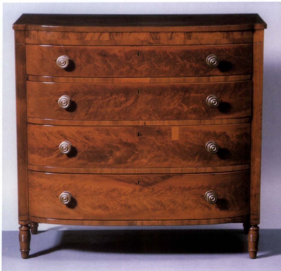
Figure 2. A veneer repair patch, located on the front of the third drawer, has faded from light. This extreme fading is typical of areas where aniline stains have been applied.

damaging to light-sensitive objects and architectural woodwork.