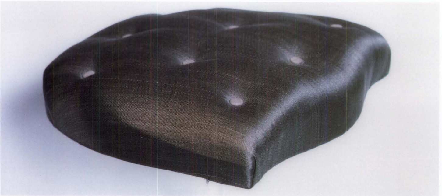
Figure 5. The chair seat, covered with reproduction black haircloth, similar to the one in figure 4, has faded in just eleven years due to exposure to unfiltered natural light. The unfaded (dark) area on the side of the seat was protected from the light by the seat rail of the chair.