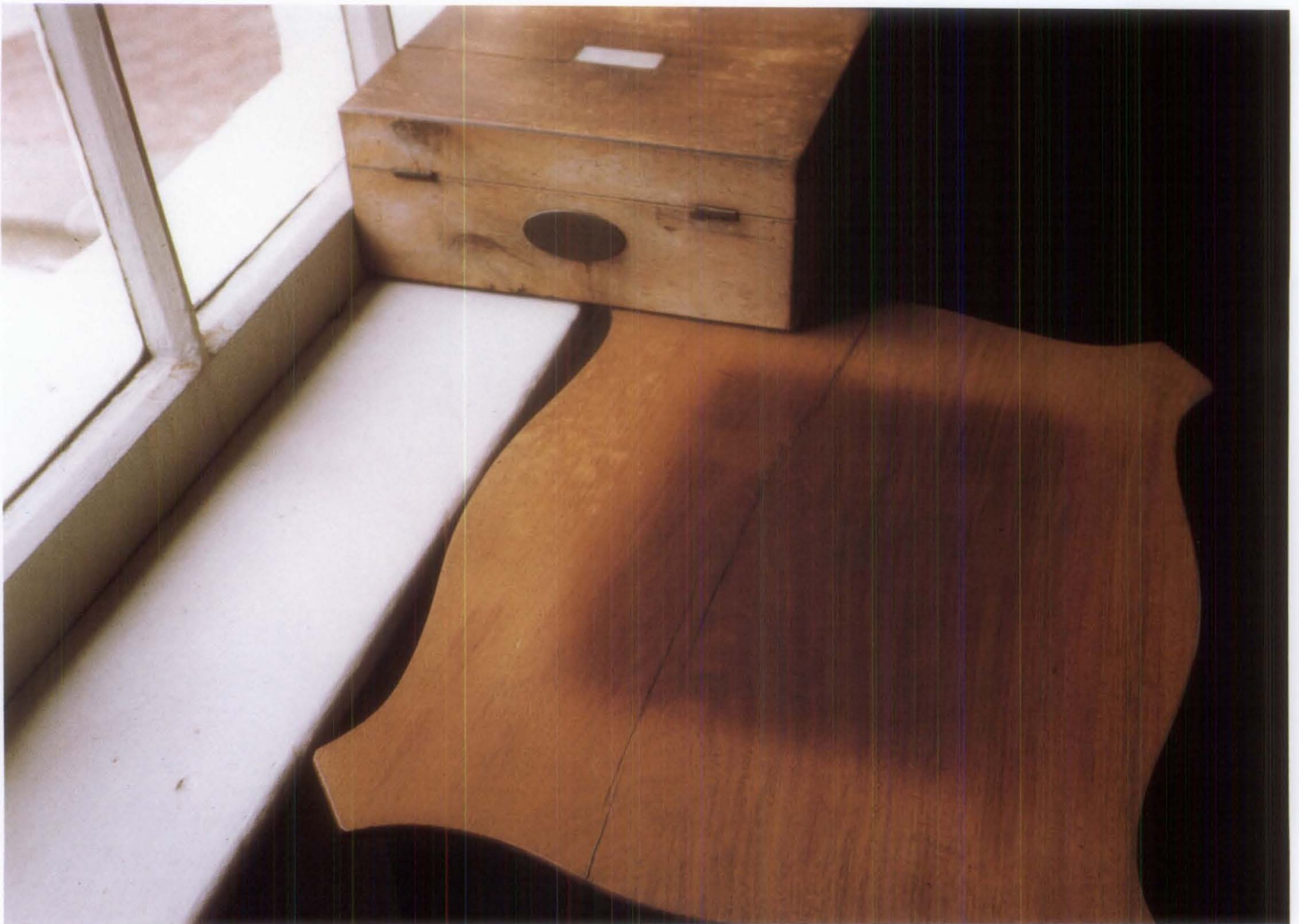
Figure 6. This small table and wooden box should not have been located beneath the window. Light has faded the finish of the table top except in the center, where the box rested and shielded the finish. The finish on the top and back of the box is nearly completely lost.