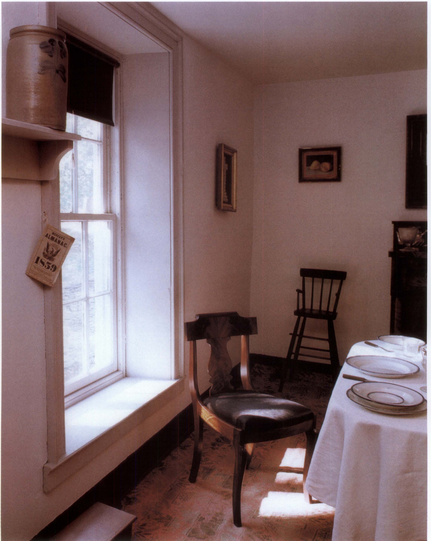
Figure 4. A number of steps can be taken to control or reduce the damage to historic furnishings caused by light entering through windows. In this house museum, a reproduction table cloth is appropriate for use in protecting the mid-nineteenth century dining room table. The chair would be better protected by moving it away from the window. The dark window roller shade should be drawn in this house museum during periods of direct sunlight and when the building is closed to the public.