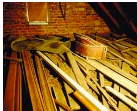
Discarded items are routinely stored within attics, then forgotten only to be discovered during a later investigation. Seemingly worthless debris may help answer many questions.

Basements generally relate more to human service functions in earlier buildings and to mechanical services in more recent eras. For example, a cellar of an urban 1812 house disclosed the following information during an investigation: first period bell system, identification of a servant's hall, hidden fireplace, displacement of the service stairs, identification of a servants' quarters, an 1850s furnace system, 1850s gas and plumbing systems, relocation of the kitchen in 1870, early use of 1890s concrete floor slabs and finally, twentieth century utility systems. While the earliest era had been established as the interpretation period, evidence from all periods was documented in order to understand and interpret how the house evolved or changed over time.