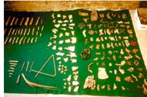
An inventory of animal nests found within hidden spaces may yield unexpected evidence about food, decorative arts, and cultural or social traditions of everyday life.

A thorough scholarly study of a building's history provides a responsible framework for the physical investigation; in fact, the importance of the link between written historical research and structural investigation cannot be overestimated. For example, the historical research of a building through deed records may merely determine the sequence of owners. This, in turn, aids the investigation of the building by establishing a chronology and identifying the changes each occupant made to the building. A letter may indicate that an occupant painted the building in a certain year; the courthouse files contain the occupant's name; paint analysis of the building will yield the actual color. Two-dimensional documentary research and three-dimensional physical investigation go hand-in-hand in analyzing historic structures. The quality and success of any restoration project is founded upon the initial research.