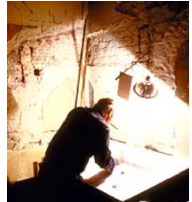
Architectural investigator at work.