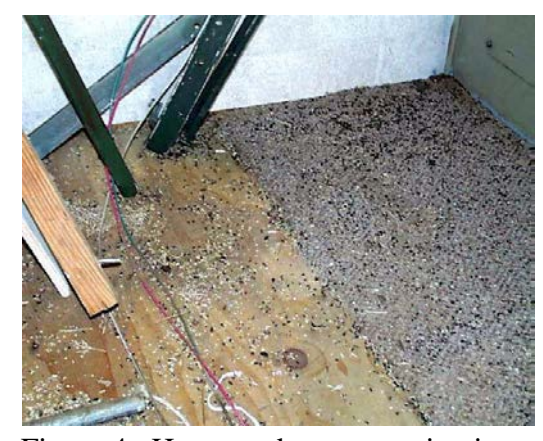
Figure 4. Heavy rodent contamination.