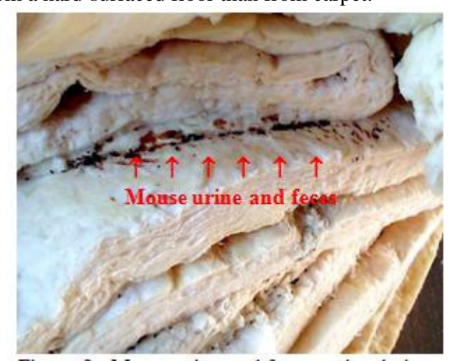
Figure 2. Mouse urine and feces on insulation.