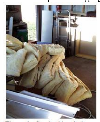
Figure 1. Stacked insulation.

Removal of rodent contamination from indoor areas will reduce the risk of personnel acquiring hantavirus infection. The level of contamination, the type of activity in the facility, and the type of personnel performing the cleanup operations will dictate the methods used and the personal protective measures to be taken. The goal of any cleanup operation is to remove rodent contaminants without exposing cleaning personnel to hantavirus-laden particles in the air or on their hands and bodies. The risk of coming into contact with hantavirus increases with the amount of contamination present and the type of cleanup required. Obviously, it is easier to clean up rodent droppings from a hard-surfaced floor than from carpet.