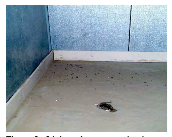
Figure 3. Light rodent contamination.

The various cleanup scenarios presented in the following text boxes illustrate the level of contamination, the cleanup methods, and the personal protection required. This information should be used as a general guide, subject to modification or change by Public Health personnel. Examples of light and heavy rodent contamination are shown in Figures 3 and 4.