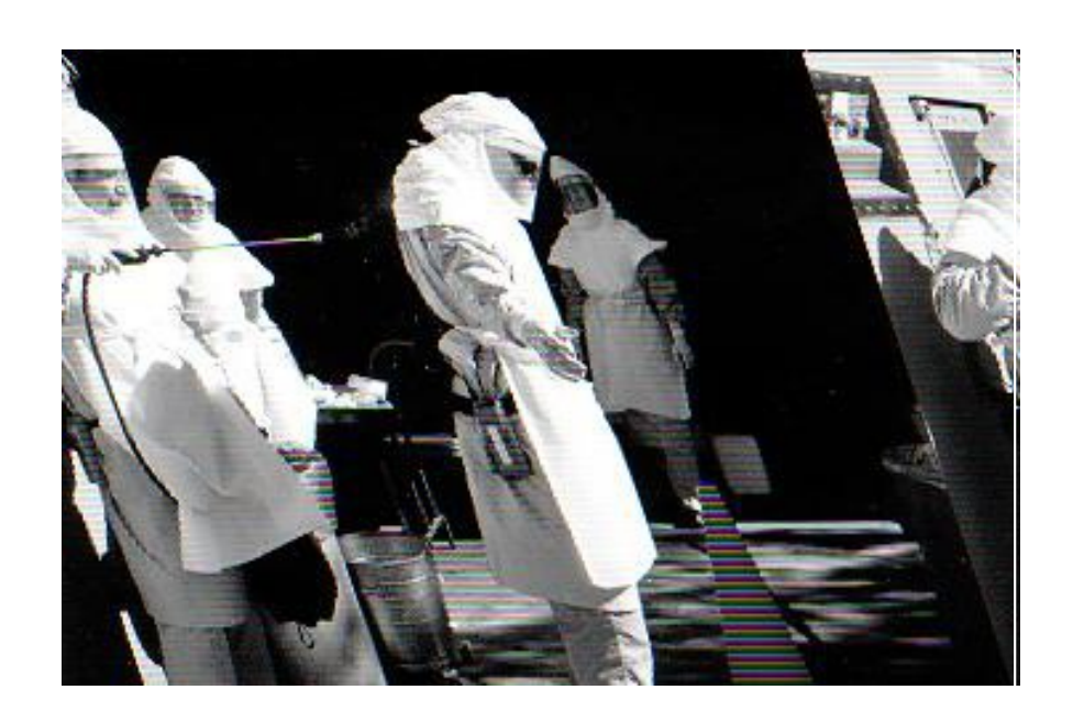
Figure 9-3. Unbuckle the PAPR battery pack and hand to the helper.