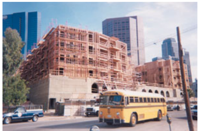
Figure 4. Apartment complex utilizing FRTW studs

The apartment complex in Figure 4 contains 500,000 square feet of residential space, 40,000 square feet of retail space, and a 350,000 square foot parking garage. The wood frame portion of the building is Type III-211-S construction. The exterior bearing walls are constructed with fire-retardant-treated wood studs. The interior framing is untreated wood.