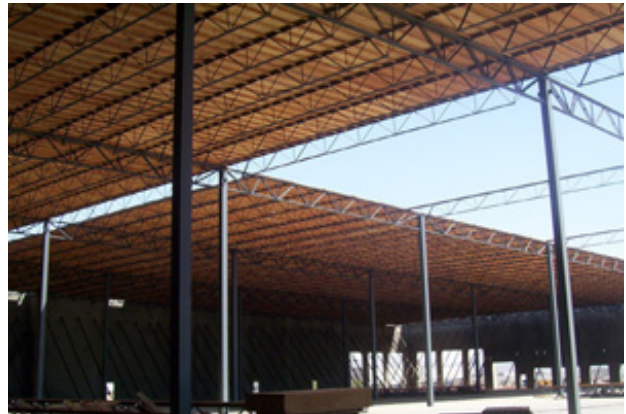
Figure 3. FRTW panelized roof system

The ability to pre-frame large roof panelized units reduce cost, cuts construction time, and enhances job site safety since fewer man-hours are spent on the roof. Panelized roof systems are one of the safest systems to erect because most of the work is accomplished on the ground during the fabrication of the large pre-framed roof panels.